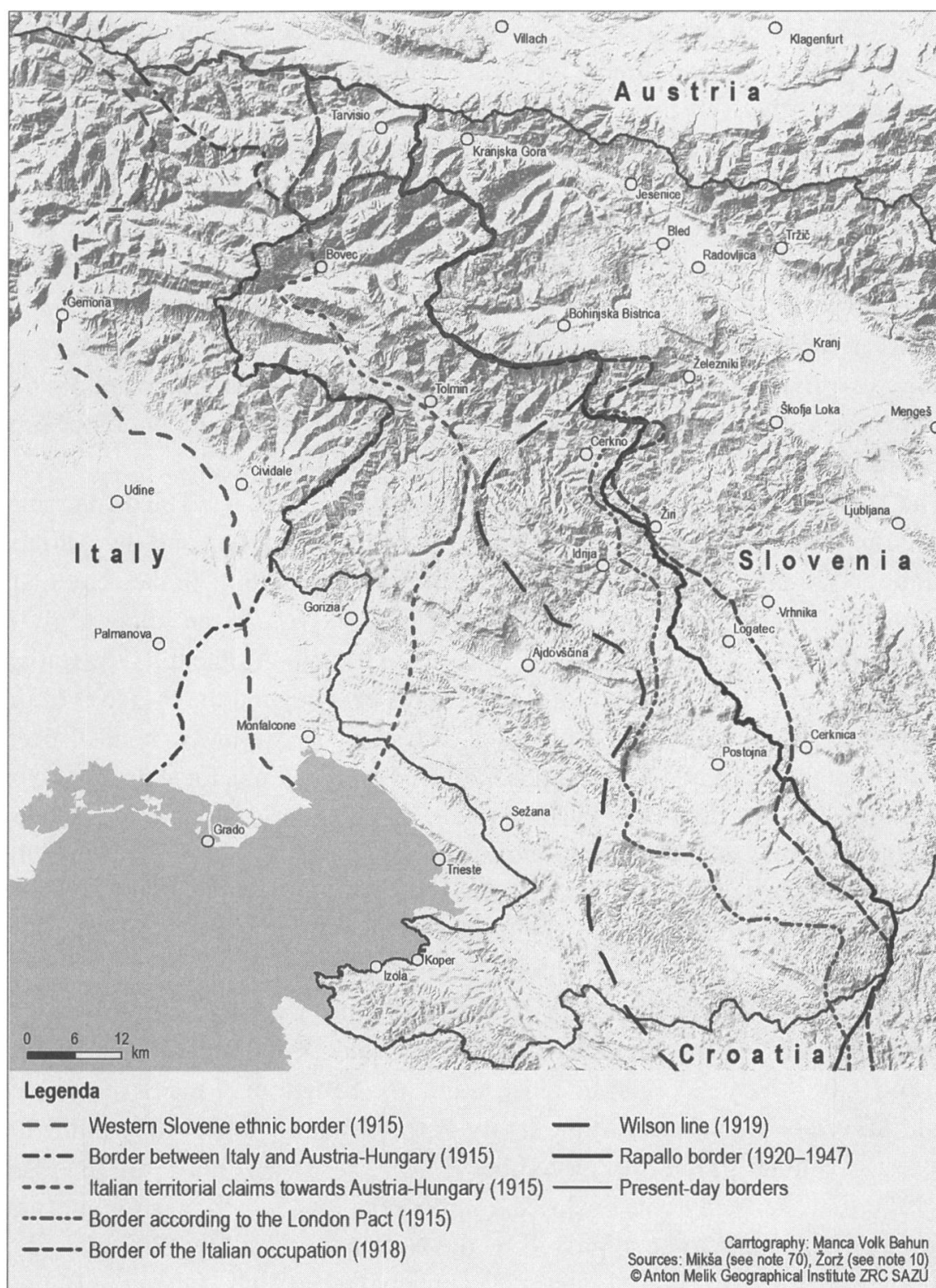
Fig. 1: The border between Italy and Austria-Hungary, and the 1915 Italian territorial demands toward Austria-Hungary; the border envisaged in the Treaty of London, the border of the 1918 Italian occupation (until 1920), and the Rapallo Border (1920–1947).