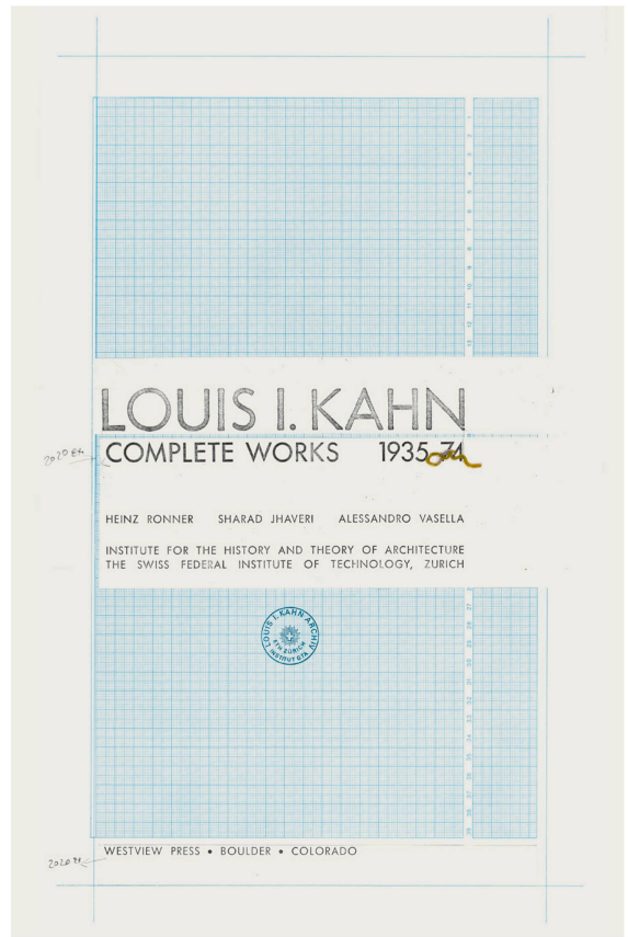
fig. 5 Title page layout for Louis I. Kahn: Complete Works 1935–74 (1977), with stamp of the “Louis I. Kahn Archiv/ETH Zürich/gta Archiv.”