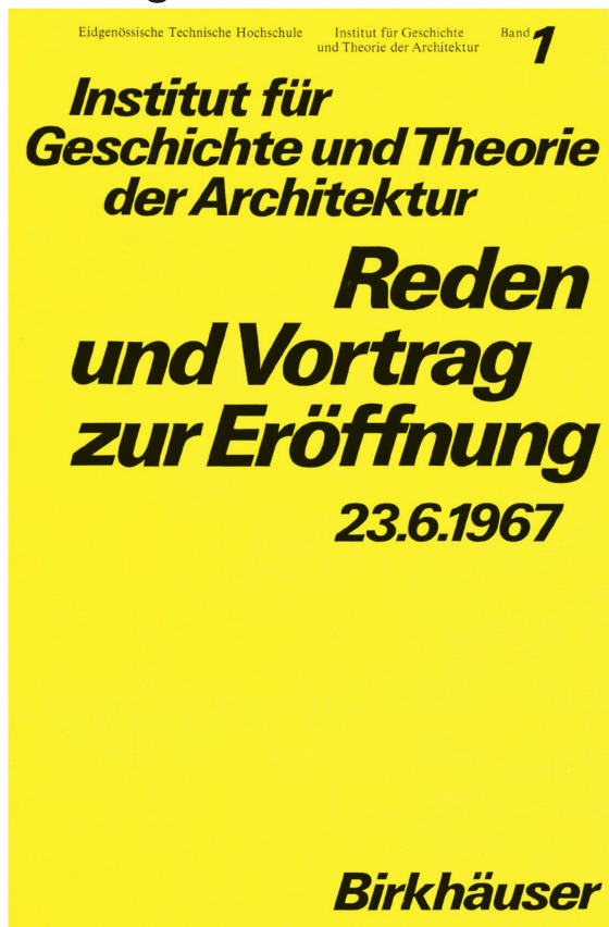
fig. 1 Hans-Rudolf Lutz, cover of the first volume in the gta series, 1968.