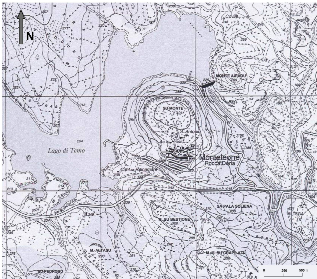
Fig. 2: Monteleone Rocca Doria