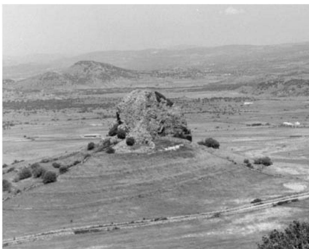
Photo 1: The neck of Pedra Mendarza, linked to Plio-Quaternary volcanism, in the surroundings of Monteleone Rocca Doria

Die Spitze des aus einer vulkanischen Phase im Plio-Quartär stammenden Pedra Mendarza, in der Umgebung von Monteleone Rocca Doria