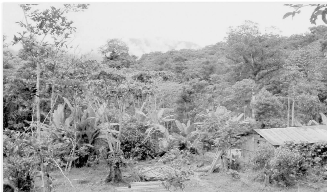
Photo 1: Napints (1,000 m): scattered settlement of the Shuar in the tropical rainforest at the eastern periphery of the Podocarpus National Park

Napints (1000 m): Shuar Streusiedlung im tropischen Regenwald am östlichen Rand des Podocarpus National-parks