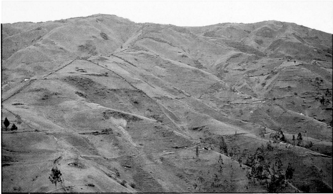
Photo 3: Deforested and overused agrarian landscape of the Mestizo-Colonos north of Loja

Entwaldete und übernutzte Agrarlandschaft der Mestizo-Colonos nördlich von Loja