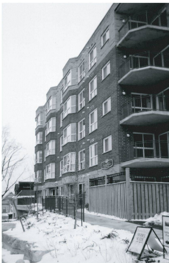
Fig. 2: An example of a non-profit retirement community

In order to analyze the types of images used to promote retirement community living, each sentence or phrase is classified into one of three categories: successful ageing, the physical aspects of community and age-related decline. A sentence or phrase that implies successful ageing is classified under the first heading: successful ageing. Successful ageing is suggested by sentences that refer to family and social roles, as well as activities that conjure up images in keeping with the idea of forestalling old age. Text depicting residents participating in group fitness activities, playing golf or tennis or shopping are examples. Sentences describing the location of the dwellings for sale and available on-site amenities are classified in a second category: physical aspects of the community. Images that indicate that the physical deterioration associated with increasing age cannot be avoided are classified under the heading «age-related decline». References to the availability of on-site medical services, intercom sys-