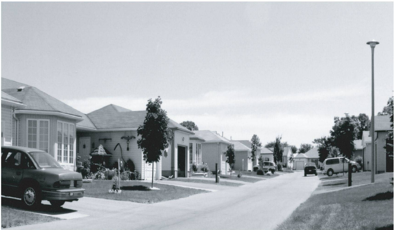
Fig. 3: Examples of the housing typically available in for-profit communities