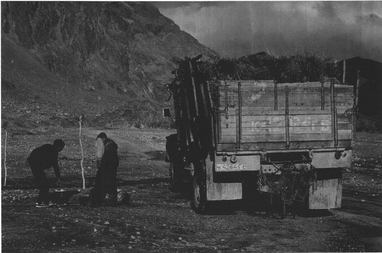
Fig. 3: Transition in Central Asia leads to a disruption of economic and social systems, with serious consequences for natural resources. Collection of rare wood biomass in high pasture areas as a substitute for fossil fuel is a focus of study by the Institute in the Pamir Mountains of Tajikistan.

Moderne Transformationsprozesse in Zentralasien führen zu einer Spaltung der ökonomischen und sozialen Systeme mit ernstzunehmenden Folgen für die natürlichen Ressourcen. Die Brennholzproblematik in Hochlagen des Pamir-Gebirges in Tadschikistan ist ein Untersuchungsschwerpunkt des Institutes.