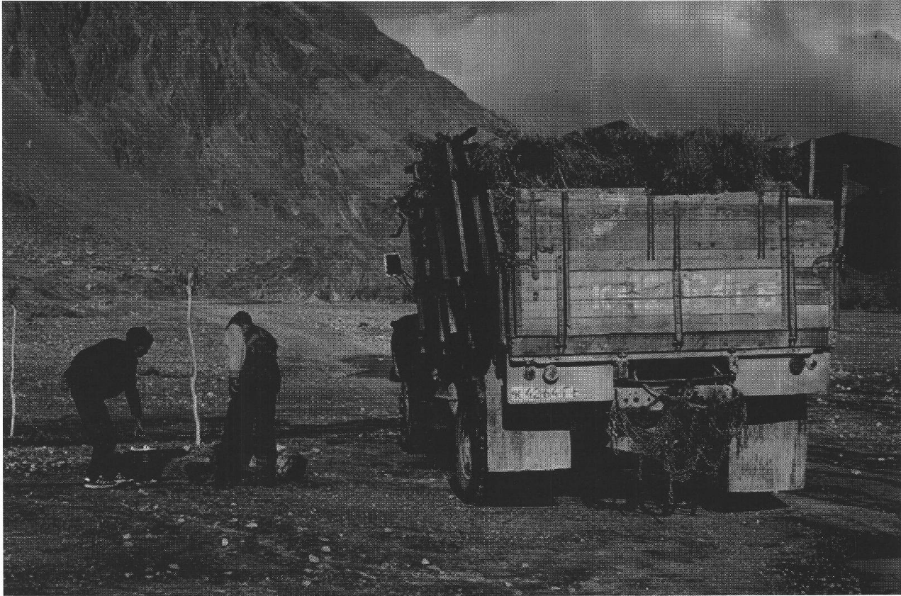
Fig. 3: Transition in Central Asia leads to a disruption of economic and social systems, with serious consequences for natural resources. Collection of rare wood biomass in high pasture areas as a substitute for fossil fuel is a focus of study by the Institute in the Pamir Mountains of Tajikistan.

Moderne Transformationsprozesse in Zentralasien führen zu einer Spaltung der ökonomischen und sozialen Systeme mit ernstzunehmenden Folgen für die natürlichen Ressourcen. Die Brennholzproblematik in Hochlagen des Pamir-Gebirges in Tadschikistan ist ein Untersuchungsschwerpunkt des Institutes.