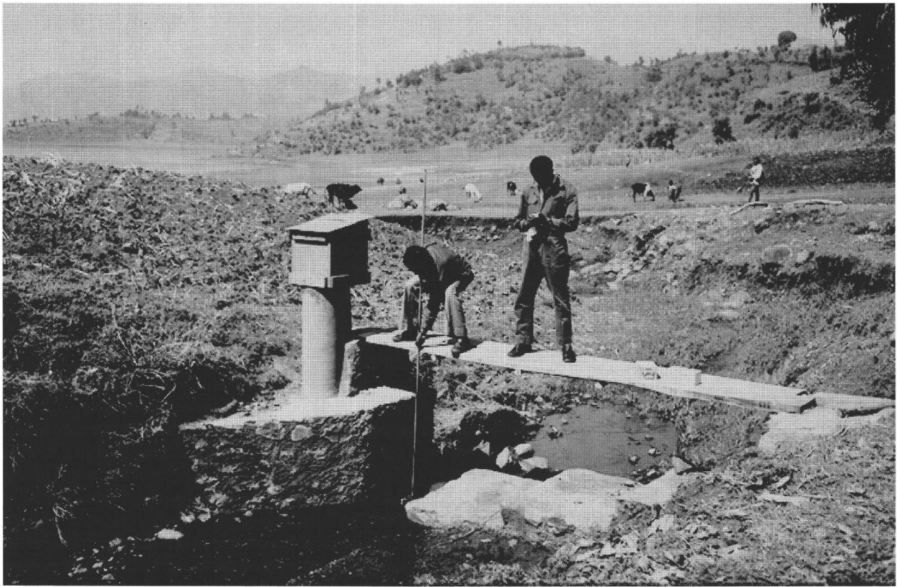
Fig. 2: Long-term monitoring of natural resource processes to gain a better understanding of the dynamics of global and local change. Catchment runoff and sediment loss are being assessed by the Institute in Maybar, Ethiopia.

Langzeitbeobachtung von Veränderungsprozessen der natürlichen Ressourcen führen zu einem besseren Verständnis der Dynamik des globalen und lokalen Wandels. Der Abfluss des Oberflächenwassers und damit assoziierte Sedimentation werden durch das Institut in Maybar, Äthiopien, erforscht.