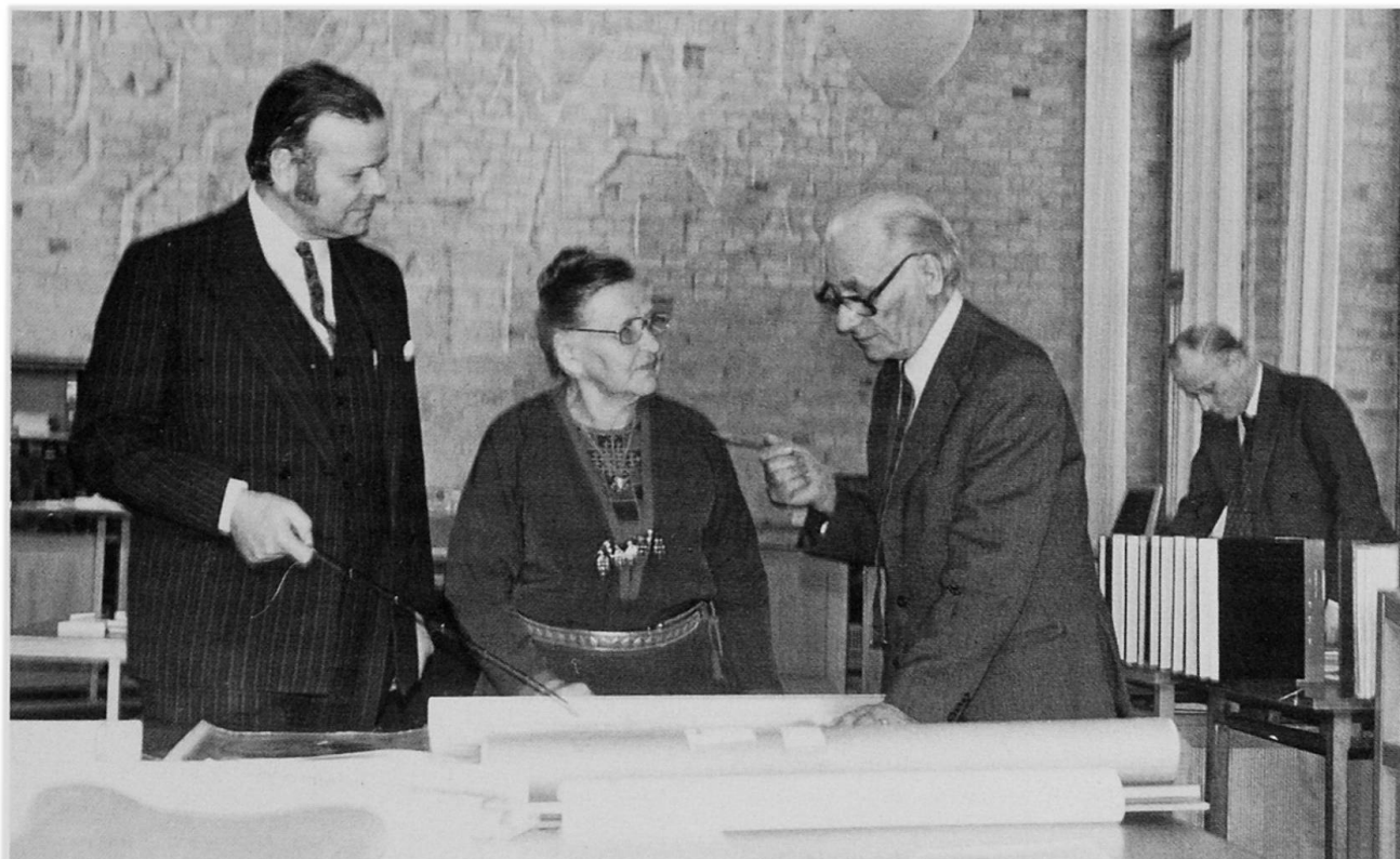
Fig. 2 Many decisive questions concerning Sámi rights have lately been actualized by means of litigation. The picture was taken during the hearing of the Taxed Mountains Case in the Court of Appeal in Sundsvall 1976. From left to right we see the Sámiombudsman, one South Sámi who attended as spectator, a key expert witness, himself a Sámi and professor in Sámi linguistics, and the legal counsel representing the Crown.

In conclusion we may point out that the Sámi codicil of 1751, unlike other legal documents, unites principles related to international law with those based on Sámi customary law. This connection makes the Codicil unique in our time; thereby it is constantly topical, being useful in the most diverse confrontations of interest.