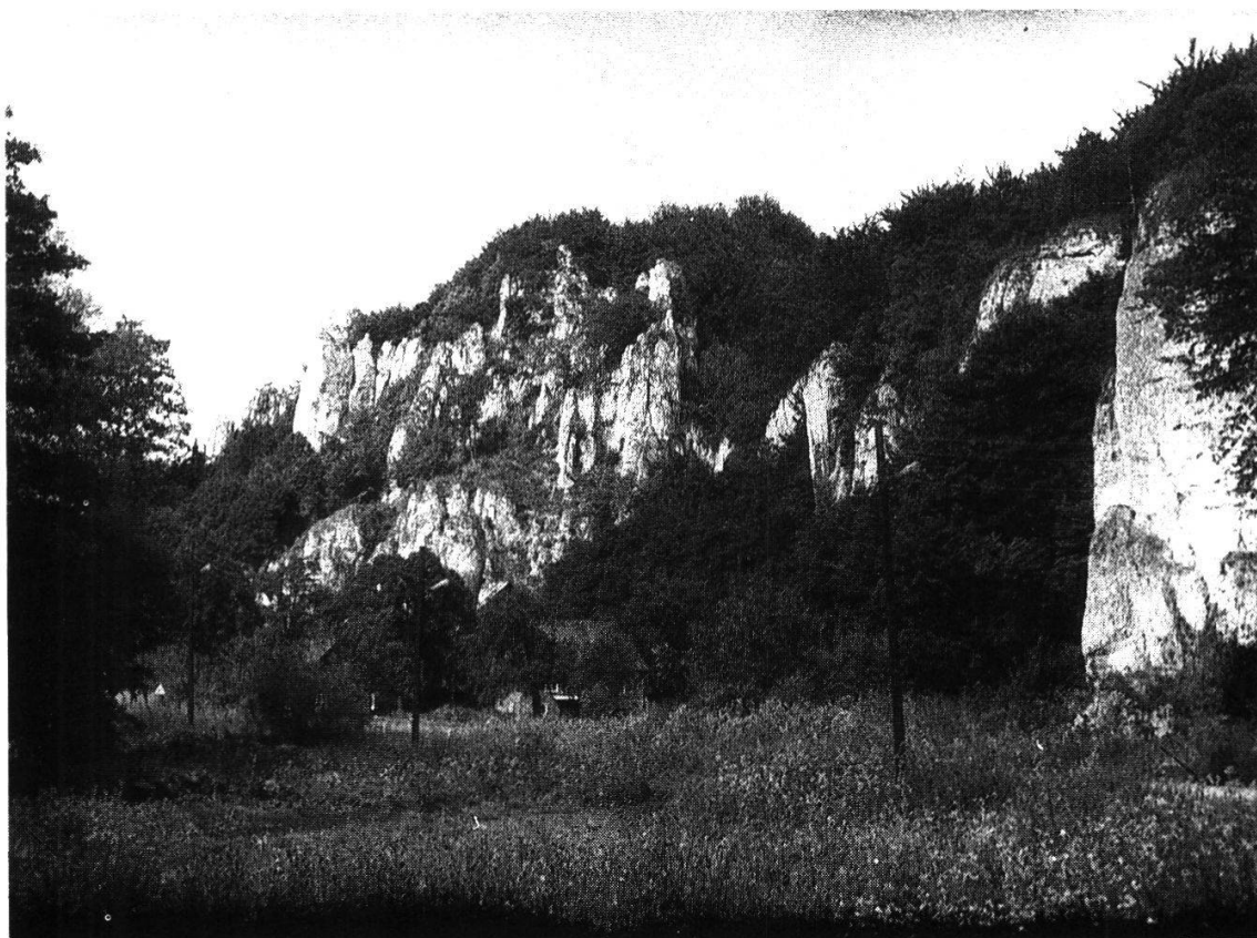
Fig. 4. The Pradnik river valley in the Ojcow National Park. Rocks with Festucetum pallentis and the xerothermic brushwood Peucedano cervariae-Coryletum ; unmown meadows with Cirsium oleraceum in the foreground.

a - acid podzolic soil, b - neutral soil (brown forest soil, rendzina soil, etc.).