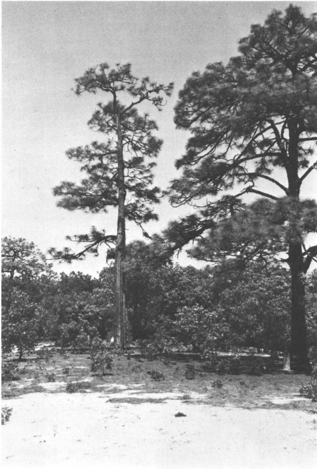
Figure 2. Longleaf pine-turkey oak forest on the Jones Lake Sand Rim, Bladen Co., N.C. The pines shown here are about 15 meters high and 250 years old. Note the turpentine scar on the center of the tree's bole.