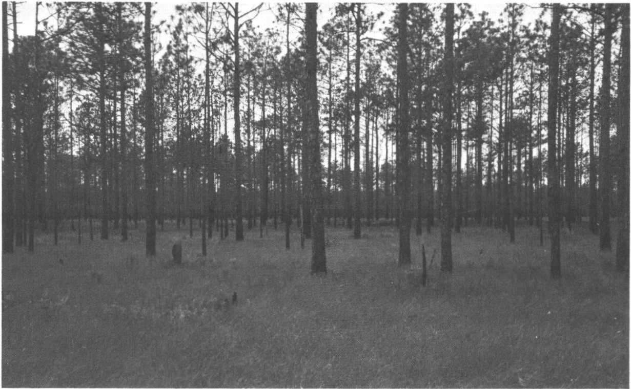
Figure 3a. Longleaf pine-wiregrass savanna in the Green Swamp, Brunswick Co., N.C. This particular area was burned about four months prior to this photograph.