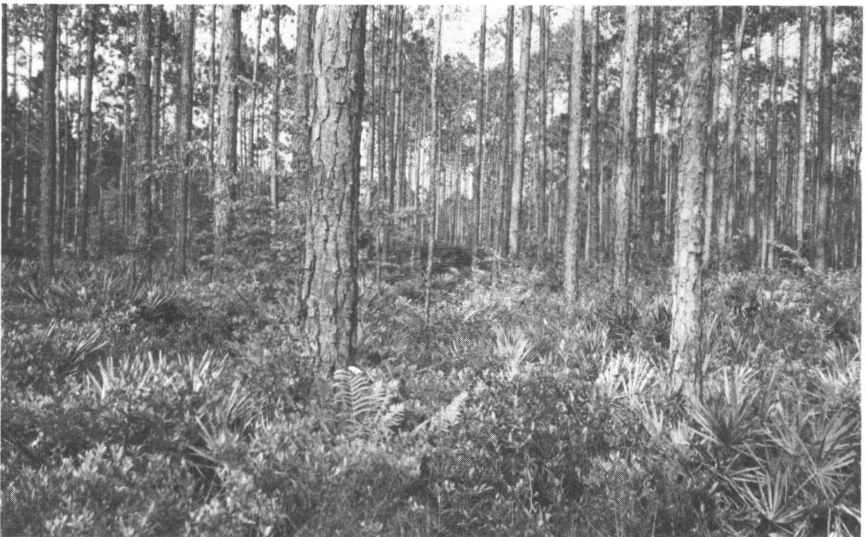
Figure 3b. Longleaf pine-palmetto flatwood near the Okefenokee Swamp, Charlton Co., GA. This area was burned three years prior to this photograph.