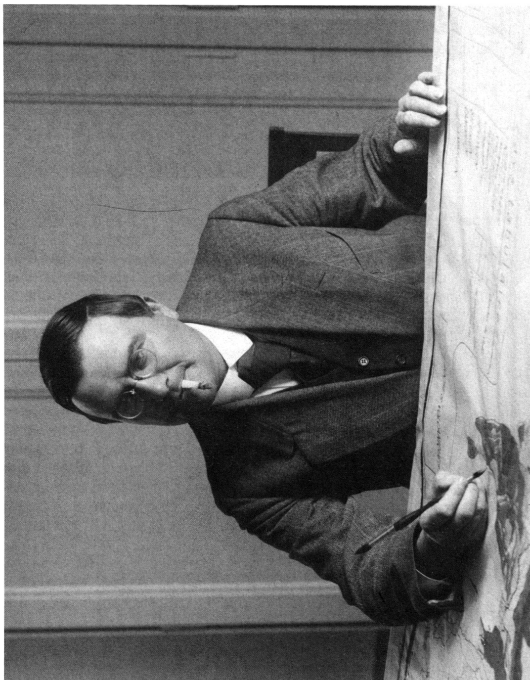
EMILE ARGAND 1879–1940