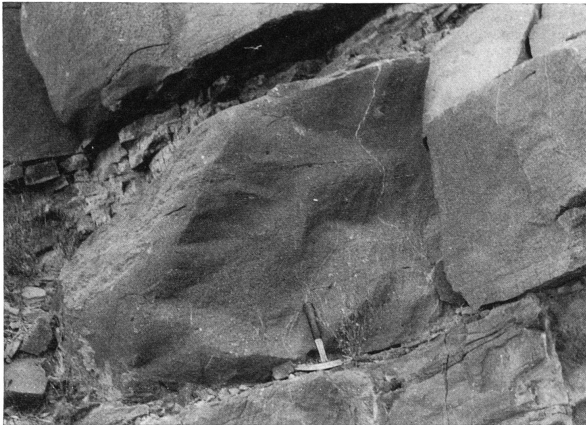
Fig. 3. Thick bed of oolitic lime grainstone with lithoclasts, showing graded-bedding. The overlying and underlying layers are thinly-bedded radiolarian cherts. Wadi Miaidin, south flank of Jebel Akhdar, Oman. Line grainstone and cherts are part of the Upper Cretaceous Hawasina Group.