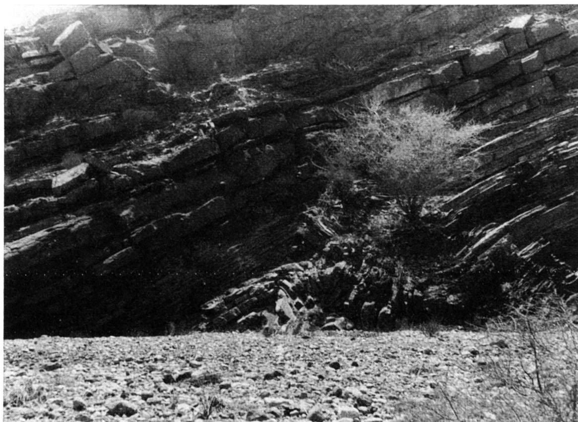
Fig. 2. Contorted, thinly-bedded radiolarian cherts alternating with thick-bedded, oolitic lime grainstones showing graded-bedding. Wadi Miaidin, south flank of Jebel Akhdar, Oman. Cherts and lime grainstones are part of the Hawasina Group which is of Upper Cretaceous age.

MORTON (1959) also mentions the existence of numerous massive slumped blocks of the sub-strata (the klippen of LEES), and remarks that the Semail itself has entrained blocks of underlying sediments.