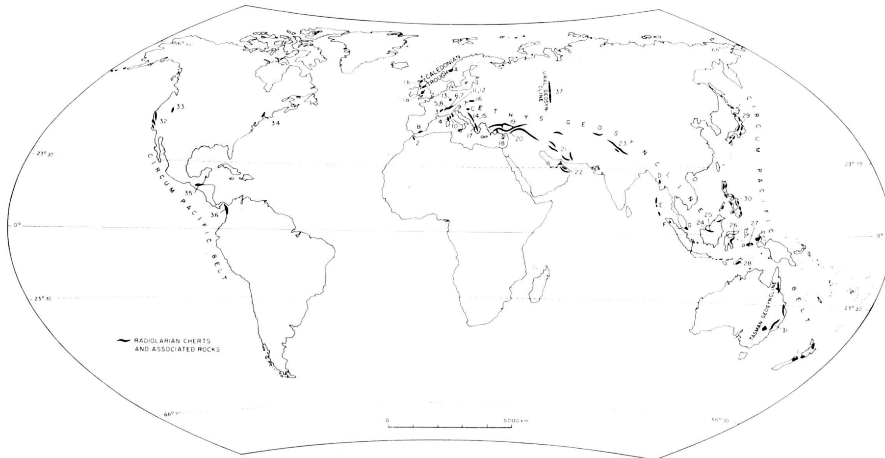
Fig. 1. Geographic distribution of radiolarian cherts and associated rocks.