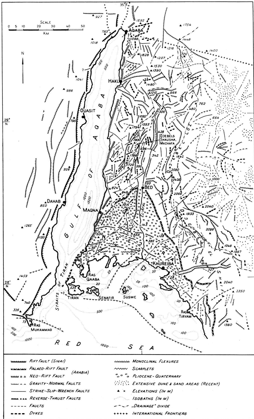
Fig. 3. Fault Patterns of Northwestern Hegaz, 1:1500000.