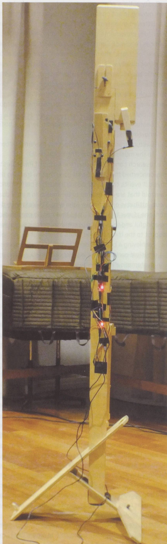
Figure 2: Paetzold recorder fully equipped with sensors.

Thanks to this auto-calibration software, the solution developed (Fig. 2) is easily applicable to any instrument and recorder player. All one has to do is to switch on the auto-calibration software and ask the musician to play a scale in which