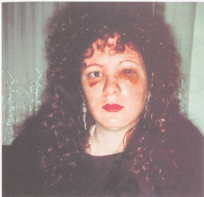
Nan Goldin: "Nan, one month after being battered (1984)". "[Nan Goldin's] use of high contrast, her impulsive compositions, and notably, her early move to color photography at a time (1973) when art photography was still largely synonymous with black and white indicate the cultivation of a self-conscious amateurish or vernacular style, a pleasing sloppiness that combines subtle aesthetic mastery with the appeal of the best off-kilter snapshot from a night of drunken carousing." Zurmomskis, Catharine, "Snapshot Photography: The Lives of Images", Cambridge: MIT Press, 2013, p. 246.