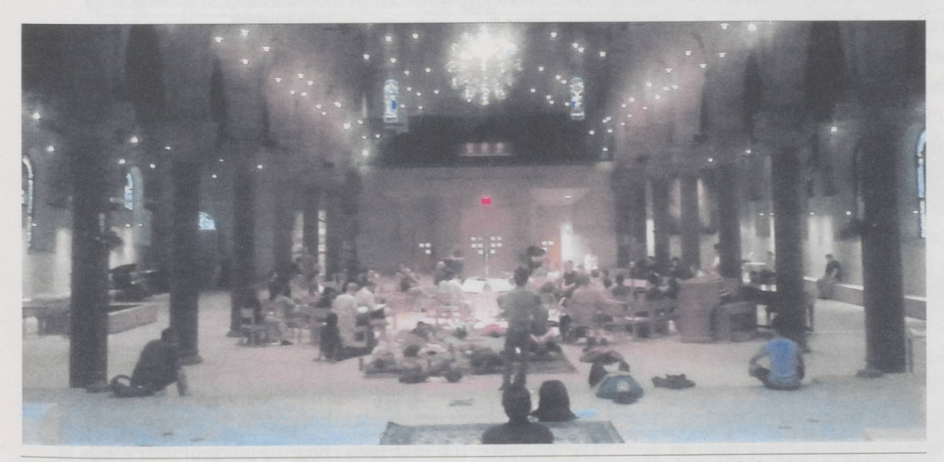
The Flux Quartet performing Morton Feldman's "String Quartet #2" in the Philadelphia Episcopal Cathedral on June 12, 2011.