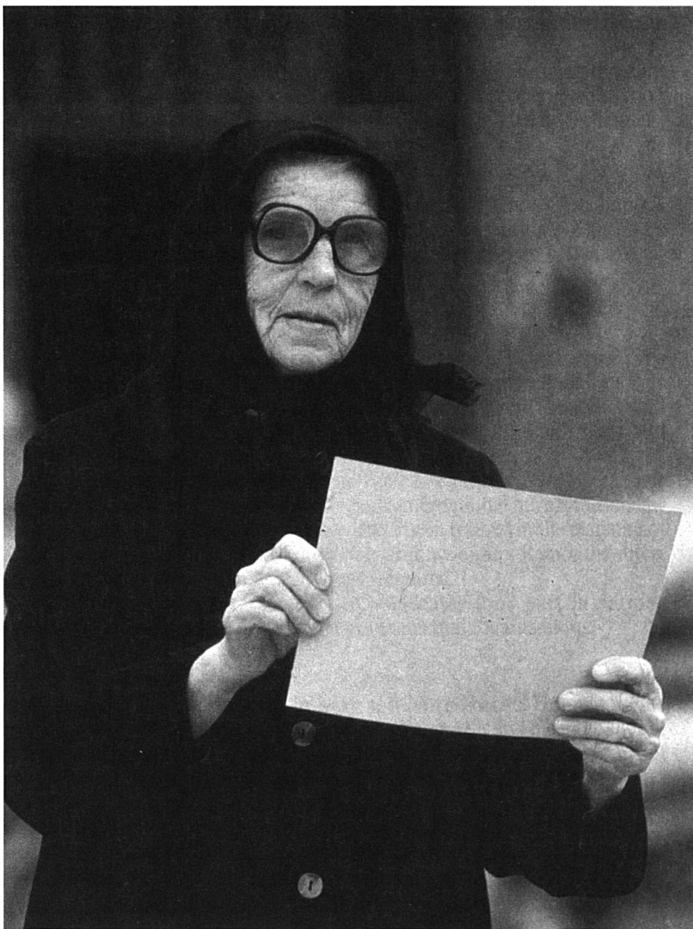
A Croatian woman in search of her son approaches the ICRC tracing agency.