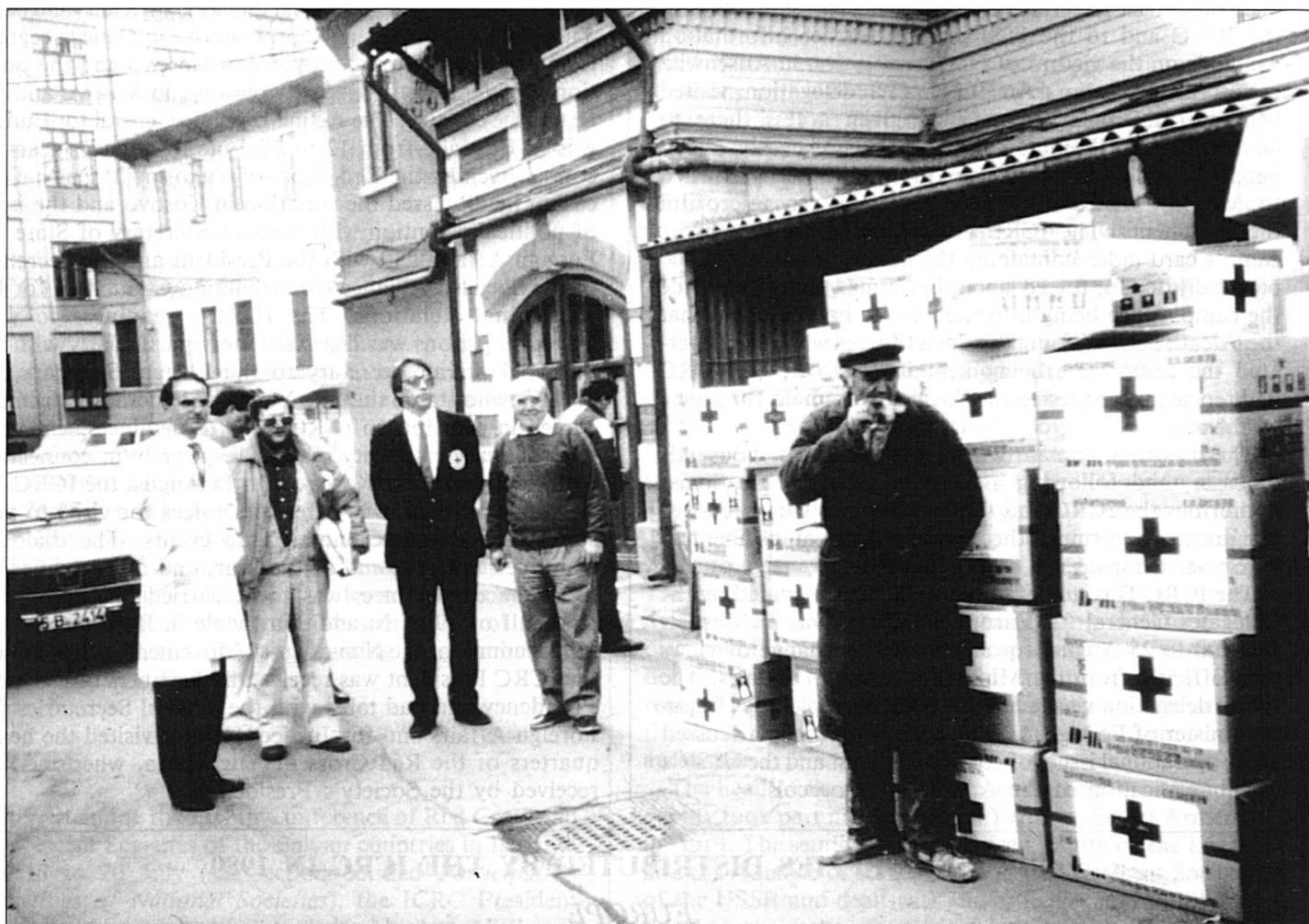
Medical assistance to a hospital in Bucharest (Romania).