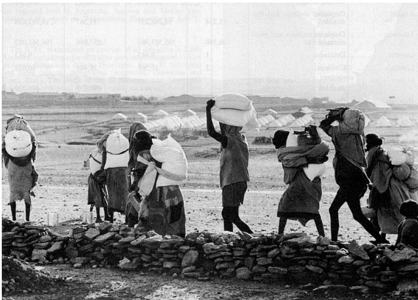
Ethiopia: Displaced persons returning to their villages after the distribution of food supplies.

and Sierra Leone provided an opportunity above all to discuss the question of the Additional Protocols of 1977 in order to further the process of accession to these instruments (Senegal ratified the Additional Protocols on 7 May 1985). From 9 to 13 December, two ICRC delegates took part in an initial seminar on the law of war for senior officers in the Sierra Leonean armed forces, which was organized jointly by the National Society and the ICRC.