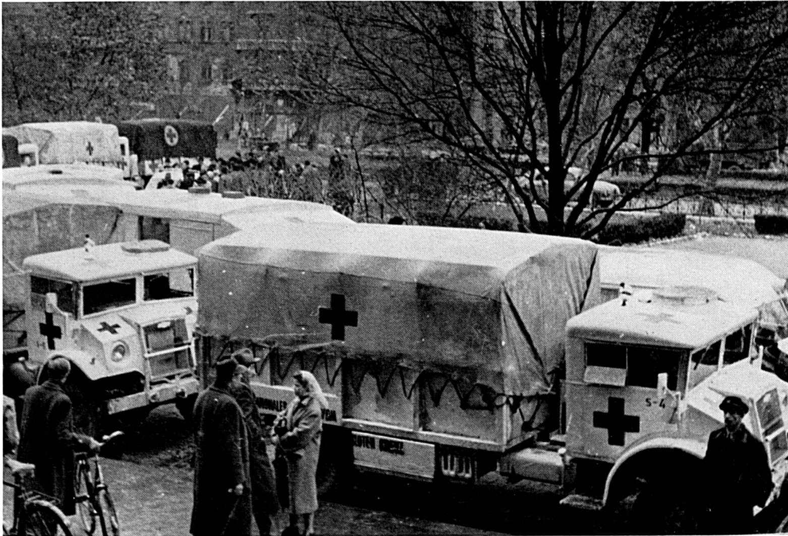
ICRC relief convoy arriving in Budapest