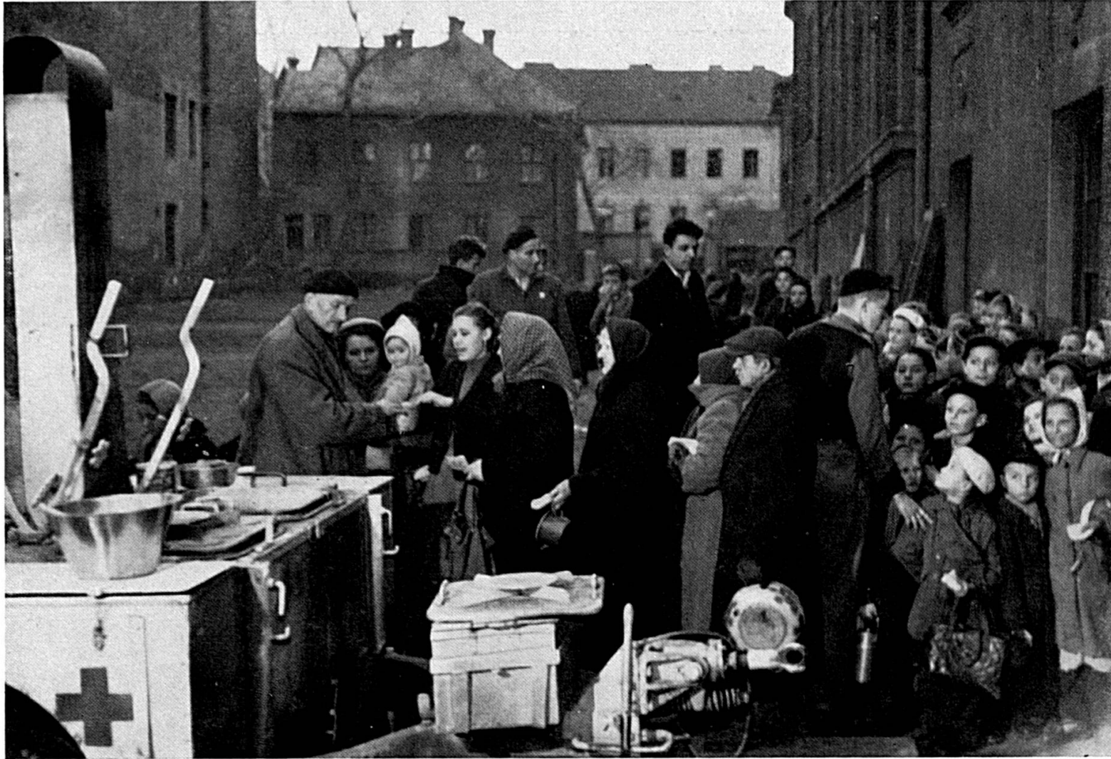
A field-kitchen set up by the ICRC in a Budapest street supplied daily meals for 300 persons