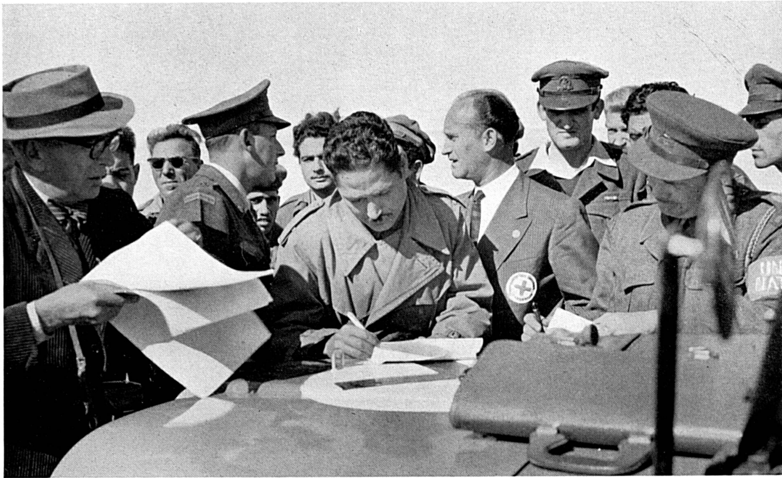
Delegates of the ICRC making final arrangements for the repatriation of prisoners of war