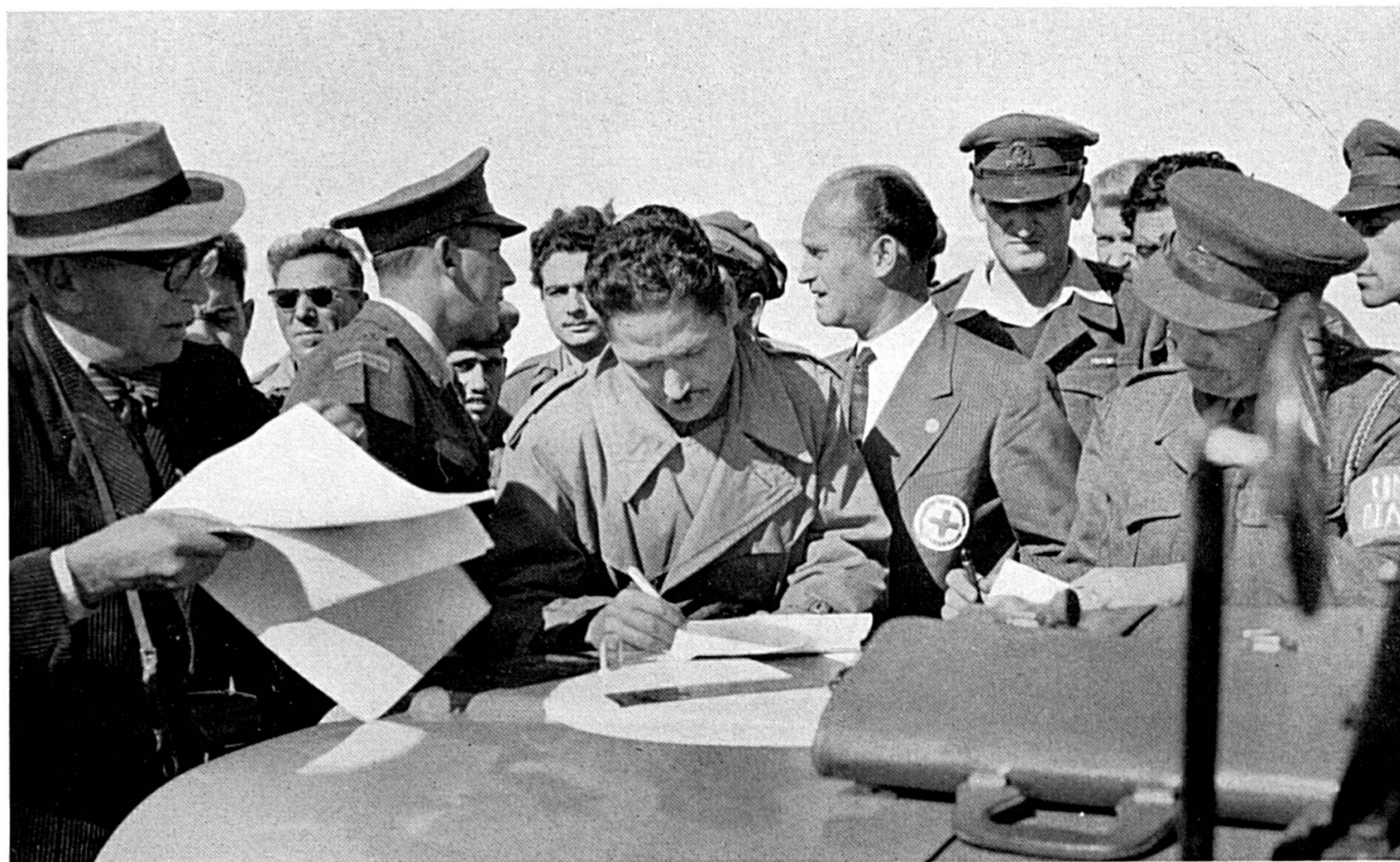
Delegates of the ICRC making final arrangements for the repatriation of prisoners of war