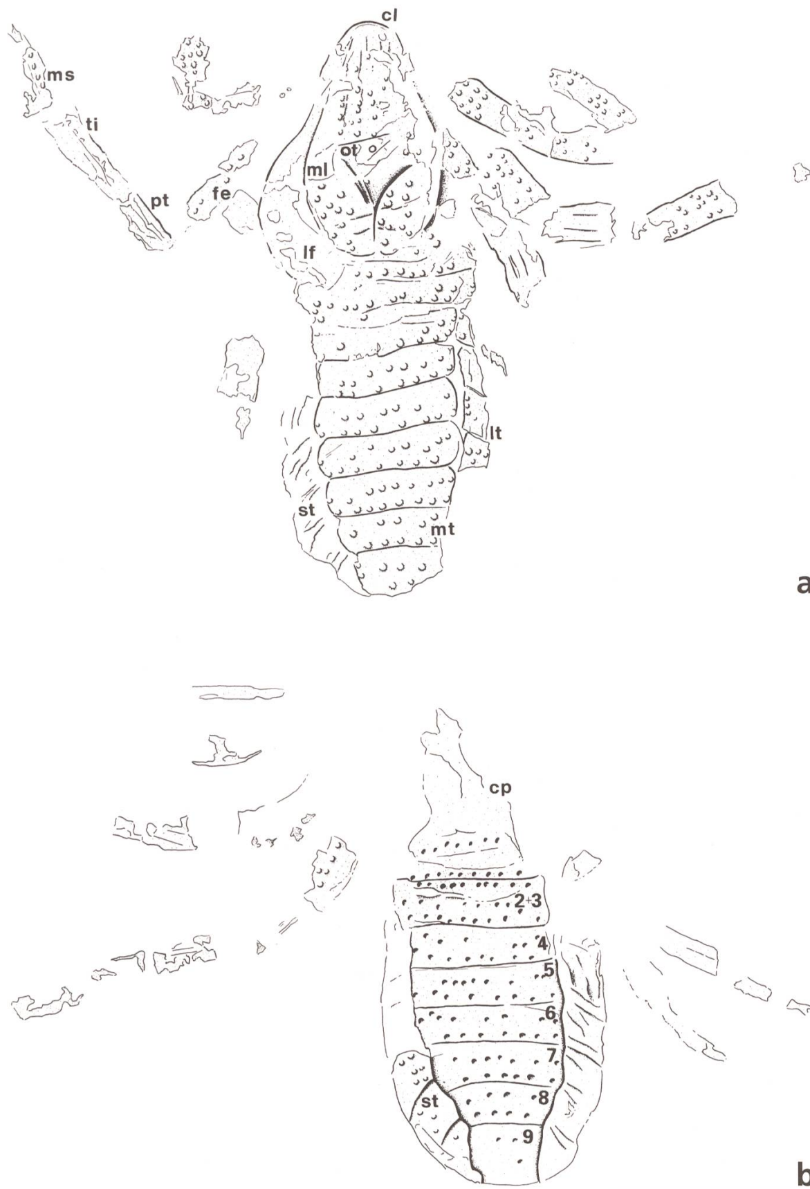
Fig. 2. Camera lucida drawings of the specimen shown in Fig. 1. – a: Part; – b: Counterpart. Abbreviations: cl = clypeus of carapace; cp = carapace; fe = femur; lf = lateral flank of carapace; lt = lateral tergite; ml = median lobe of carapace; ms = metatarsus; mt = median tergite; ot = ocular (median eye) tubercle; pt = patella; st = (superimposed) sternites; ti = tibia. Opisthosomal tergites numbered from 2+3 (a diptotergite) to 9. Scale bar equals 5 mm.