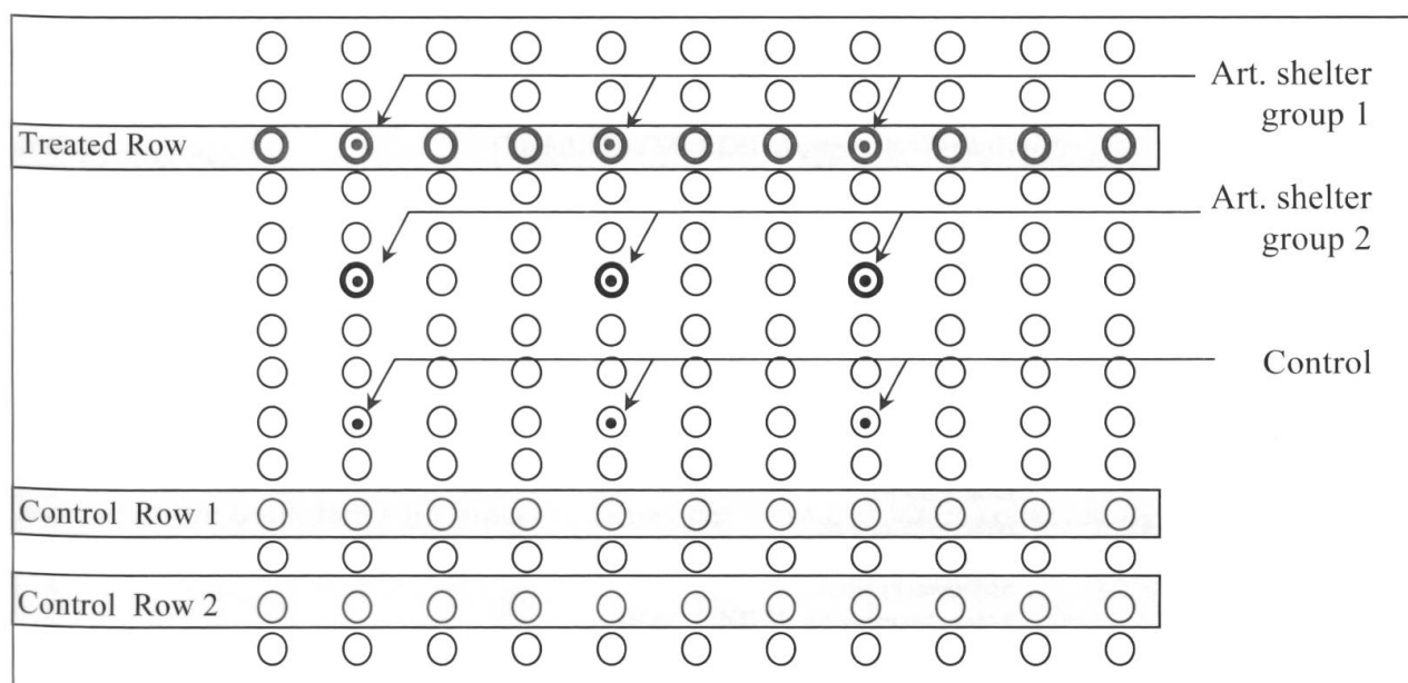
Fig. 1. Experimental design. Circles represent the trees in the apple orchard, bold black circles refer to trees provided with artificial shelters, black dots indicates trees chosen for spider sampling. Rows chosen for the evaluation of insect damage are indicated in shaded grey boxes. Distances and number of trees are not true to scale, see text for details.

To study the cumulative effect of vicinity we sorted the trees provided with artificial shelters into two groups of three trees each: Artificial shelter group 1 and Artificial shelter group 2. Artificial shelter group 1 is included in the treated row; Artificial shelter group 2 consists of three trees that are part of a row without any other artificial shelters (see Fig. 1).