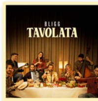
BLIGG: “Tavolata” 2024

This time last year, Bligg seemed to be talking an awful lot about growing old and being a dad. He said his priorities had changed. Withdrawing from the limelight, he had apparently developed a taste for travel – and for kicking back on the sofa. When the “Tradition” album dropped, it was rumoured that it was probably the final LP of the Zurich rapper’s long career. But no sooner had the dust settled than Bligg’s next record was out this autumn. And this one is different. On “Tavolata”, the rapper looks back on his own music, presenting a body of work that spans over two decades. But “Tavolata” is not your usual best-of album. All the tracks are new versions of his old songs.