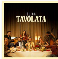
BLIGG: “Tavolata” 2024

This time last year, Bligg seemed to be talking an awful lot about growing old and being a dad. He said his priorities had changed. Withdrawing from the limelight, he had apparently developed a taste for travel – and for kicking back on the sofa. When the “Tradition” album dropped, it was rumoured that it was probably the final LP of the Zurich rapper’s long career. But no sooner had the dust settled than Bligg’s next record was out this autumn. And this one is different. On “Tavolata”, the rapper looks back on his own music, presenting a body of work that spans over two decades. But “Tavolata” is not your usual best-of album. All the tracks are new versions of his old songs.