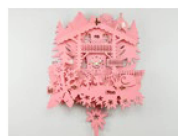
A SwissKoo cuckoo clock