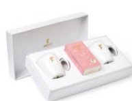
The pinnacle of tea: a Sirocco tea set