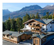
Hotel Sarain in Lantsch/Lenz (GR)