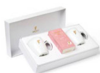
The pinnacle of tea: a Sirocco tea set