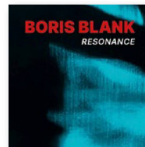
BORIS BLANK: "Resonance" (Universal, 2024)

When news dropped of Boris Blank's third solo record, the details sounded anything but promising. The synth wizard from Yello, regarded for decades as one of the key pioneers of electronic music, had composed an album for spas – music to accompany eucalyptus steam in the mixed sauna, interspersed by the chirping of exotic birds on the loudspeaker.