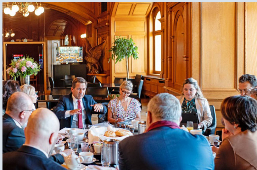
Members of the Swiss Abroad parliamentary group often meet early in the morning at the Federal Palace. Here they are in discussion with former Federal Chancellor Walter Thurnherr.

The spring session of the Swiss parliament saw the reconstituted Swiss Abroad parliamentary group convene for its first meeting – a fitting juncture for us to look more closely at the group.