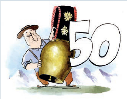
Cartoon: Max Spring

The full article was published in the July 2024 edition or read it at https://tinyurl.com/swissreviewarticle .