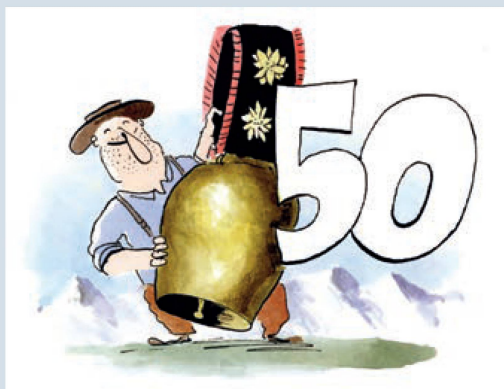
Cartoon: Max Spring

The full article was published in the July 2024 edition or read it at https://tinyurl.com/swissreviewarticle .