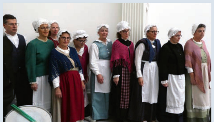
La Voce del Brenno Choir at The Swiss Church, London.