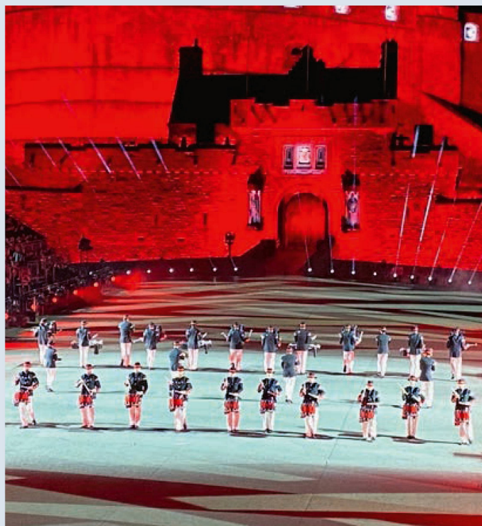
The Majesticks drum corps at their debut at the Military Tattoo 2024