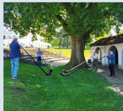
A number of Swiss people also present.