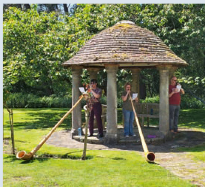
The weather was perfect!