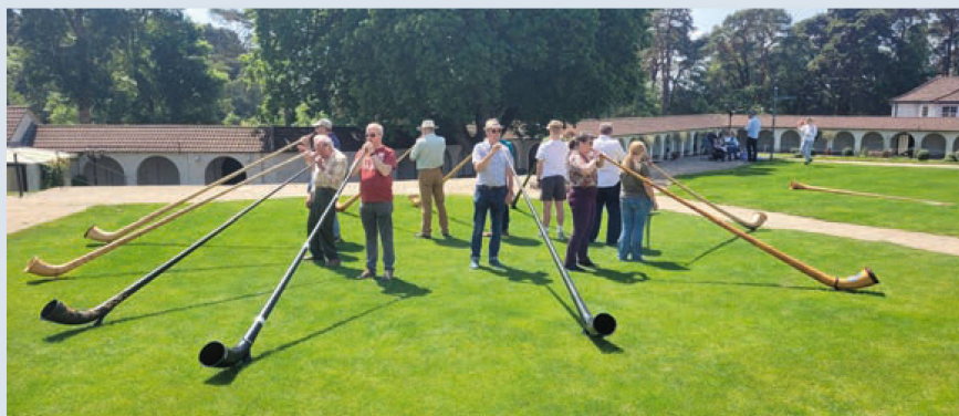
BBC TV, radio and press coverage conveyed the joy, delight and uniqueness of the special day.