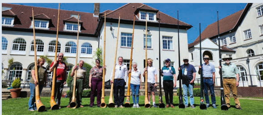
Bringing the experience to UK alphorn owners to play in Alpine ensembles.