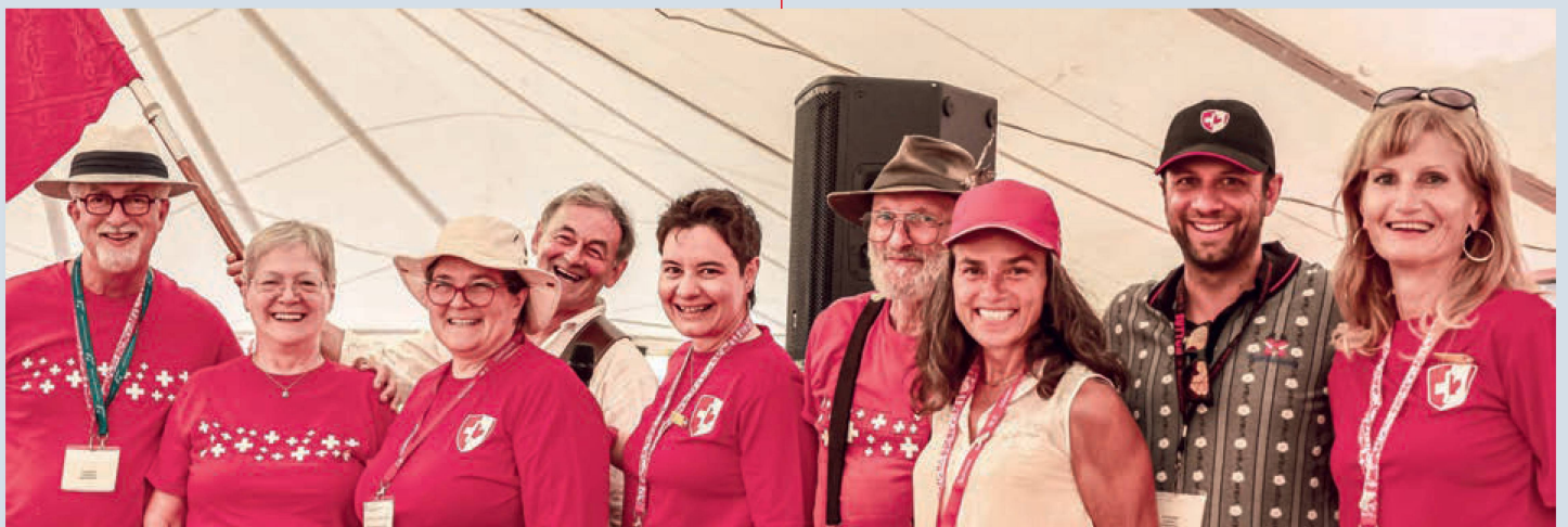
VOTRE COMITÉ 2024

We're always looking for people interested in taking on responsibilities to be part of our organising committee. Contact us at fedesuisse@gmail.com .