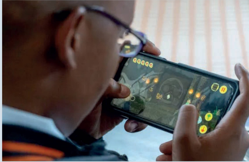
A boy is engaged in the game. Gamification turns the application into an exciting adventure.