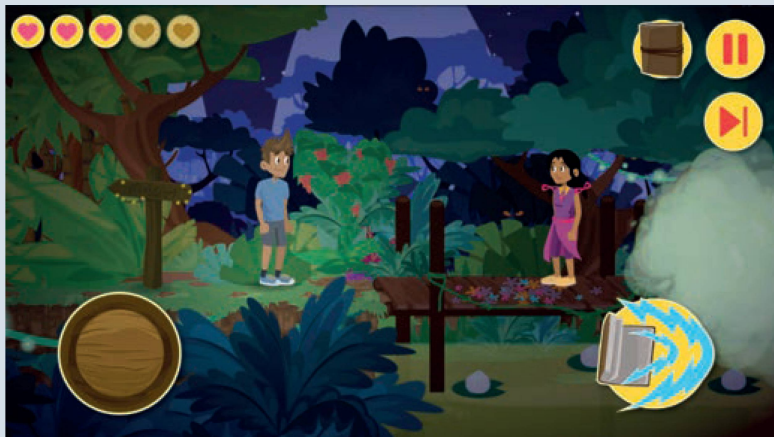
Encounter on Jungle Lady Island: a scene from the app. lovelandgame.org