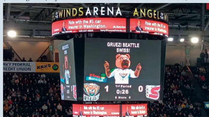
Everett Silvertips welcomes the Seattle Swiss with a nice Gruezi on February 10.