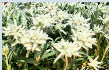
Edelweiss (see story on page 11)

I wish you a happy Summer and a great 1st of August celebration.