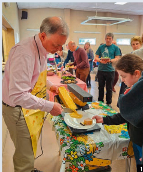
More than 60 attendees for the annual raclette.

For more information, please contact laure.pasteiner@ntlworld.com or margrith@btconnect.com .