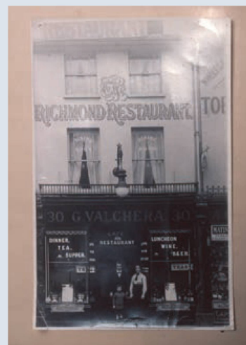
A historical picture of Valchera's in Richmond.

Nabila: Emigrating over 100 years ago was a completely different experience than mine, and the character of Irìde will need to flourish through a thorough understanding and physical embodiment of those times as much as my indelible Ticinese essence.