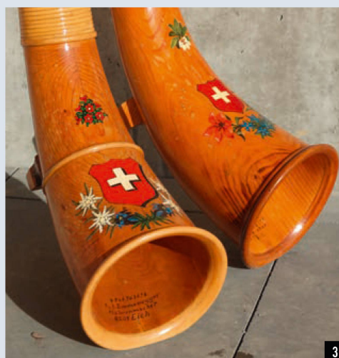
UK Alphorn Network's PlayDay 2024.