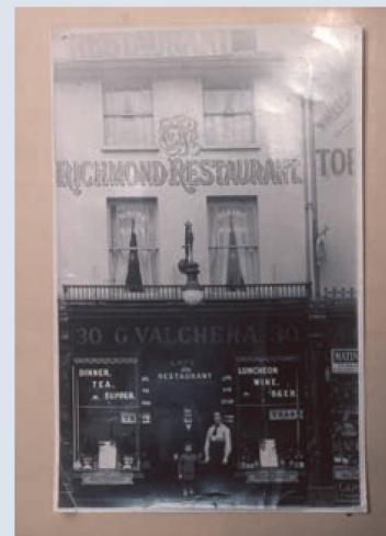
A historical picture of Valchera's in Richmond.

Nabila: Emigrating over 100 years ago was a completely different experience than mine, and the character of Iride will need to flourish through a thorough understanding and physical embodiment of those times as much as my indelible Ticinese essence.