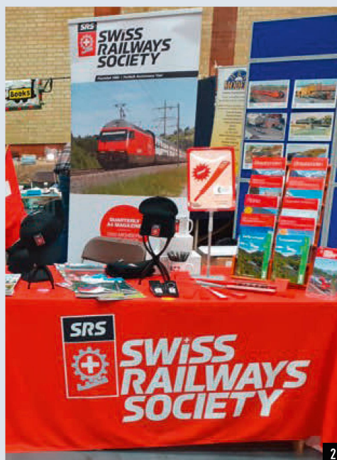
The event took place in London.

On the 27 th of April 2024, our Society convened for its Annual General Meeting at the esteemed Kidderminster Railway Museum. Nestled adjacent to the picturesque Severn Valley steam railway and mainline railway stations in Station Approach, Comberton Hill, Kidderminster DY10 1QX, the museum provided an ideal setting for our gathering. Complementing the AGM was a charming exhibition featuring Swiss railway layouts and esteemed traders offering a variety of model railway equipment. Open to both members and non-members alike, our exhibition welcomed visitors in exchange for a nominal donation to support our organizational efforts. Further information can be accessed on our official website: swissrailsoc.org.uk .