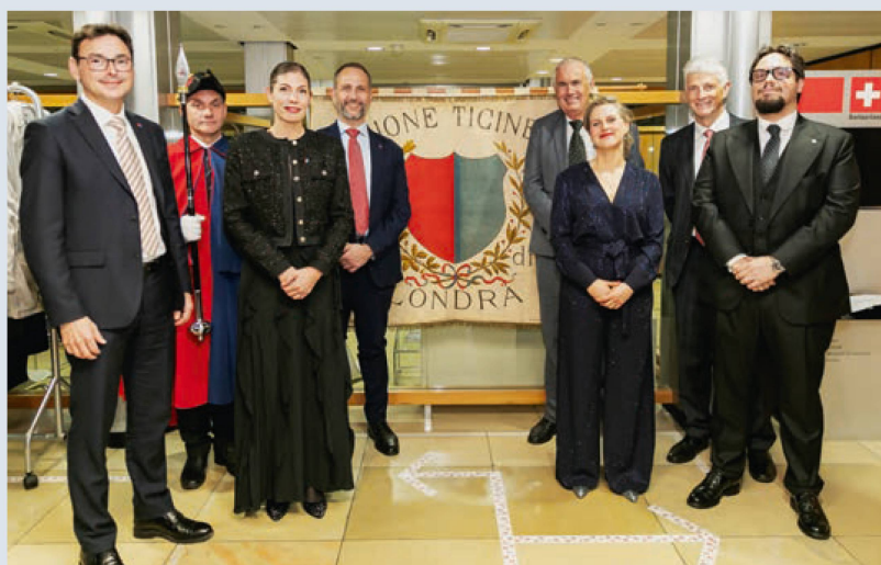
The official delegation of Cantone Ticino.