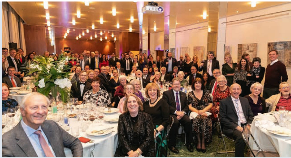
Recreation of the 1903 UT banquet photograph during the gala soiree at the Embassy on the 10 th of February.