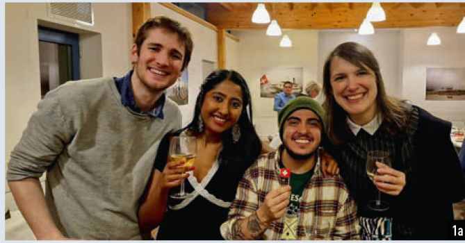
Gathering of members at Lutherhaus in Dublin.

For information about future events, please send an email to swissclubireland@hotmail.com or follow us on Facebook or Instagram.