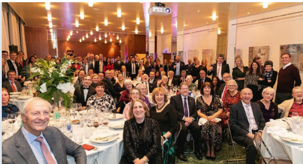
Recreation of the 1903 UT banquet photograph during the gala soiree at the Embassy on the 10 th of February.