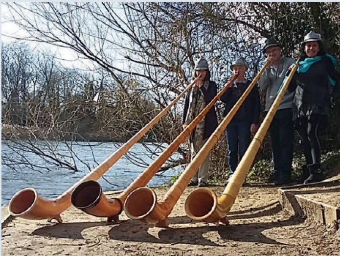
Bring your Alphorn and register by May the 1 st .