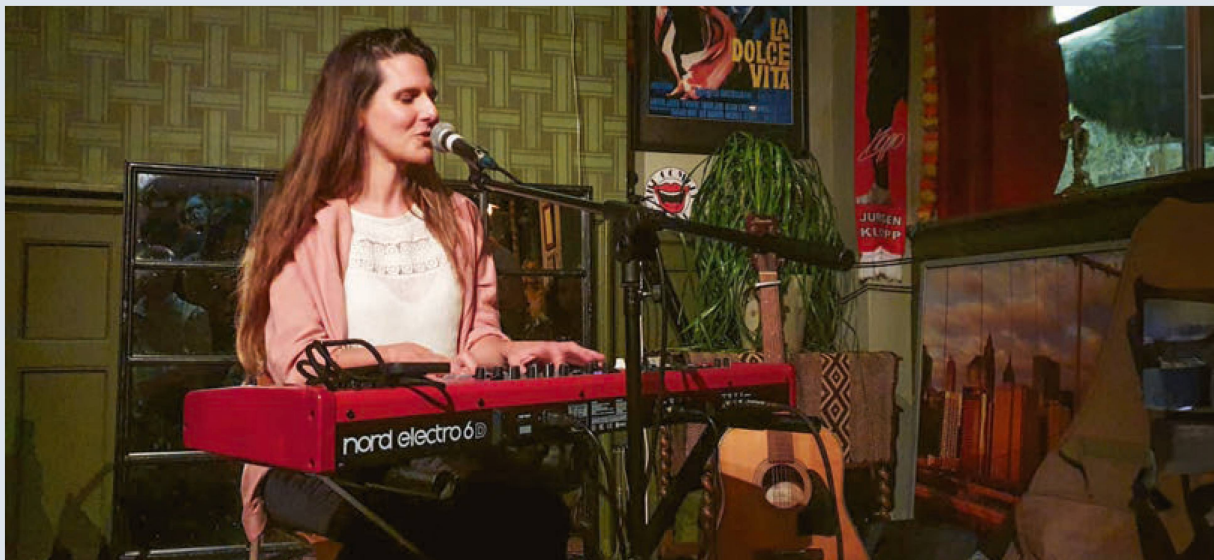
Leti leads song writing circles and advocates for women.