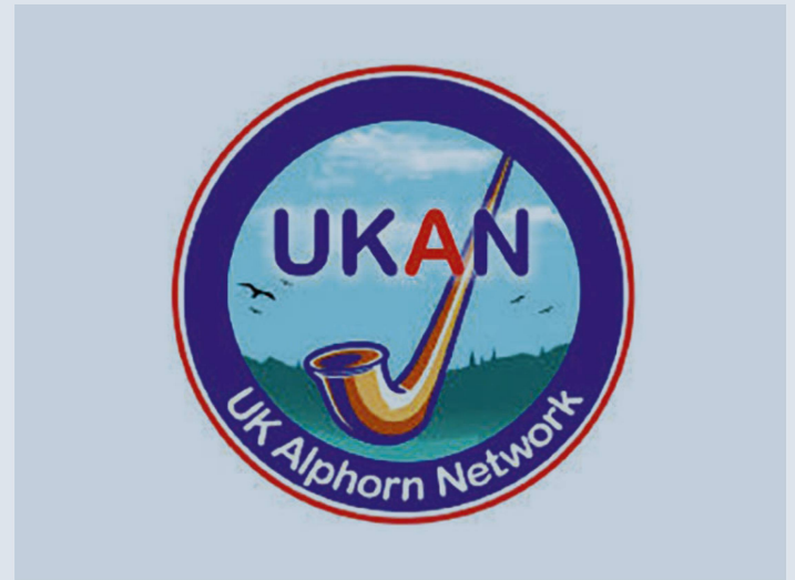
This event promises a day filled with music and friendship.