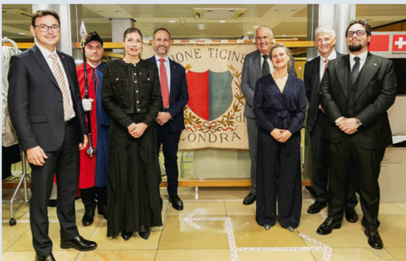
The official delegation of Cantone Ticino.