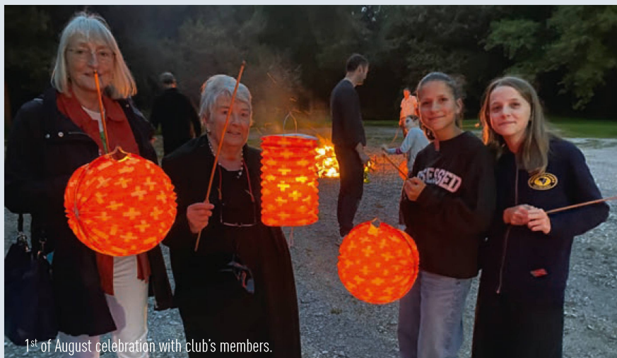
1st of August celebration with club's members.