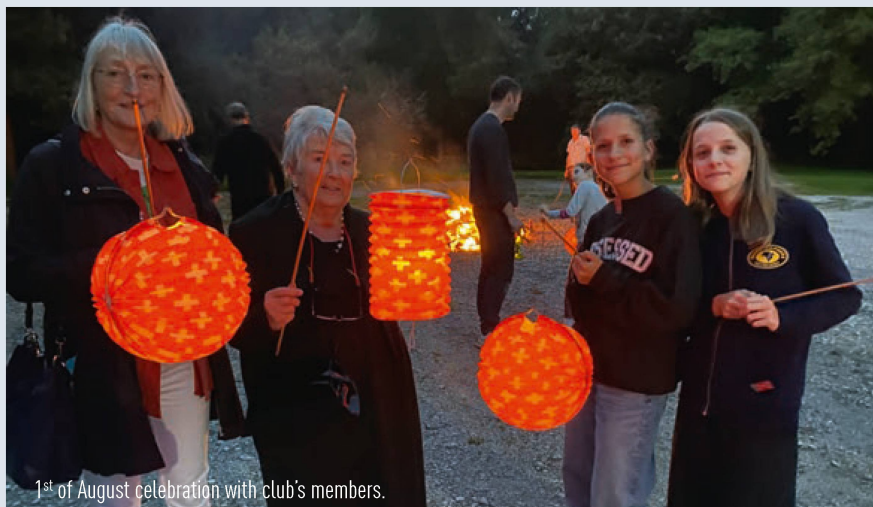
1 st of August celebration with club's members.

For more information, please contact laure.pasteiner@ntlworld.com or margrith@btconnect.com