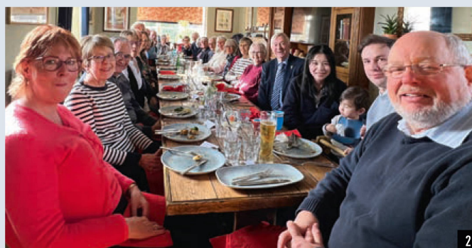
26 adults and 1 child savoured the Club's January lunch.