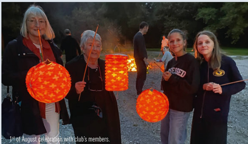
1 st of August celebration with club's members.

For more information, please contact laure.pasteiner@ntlworld.com or margrith@btconnect.com