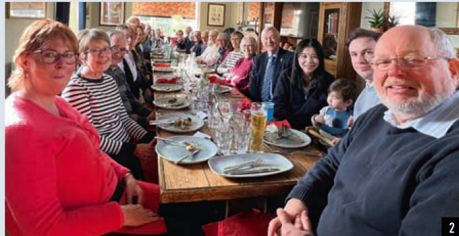
26 adults and 1 child savoured the Club's January lunch.