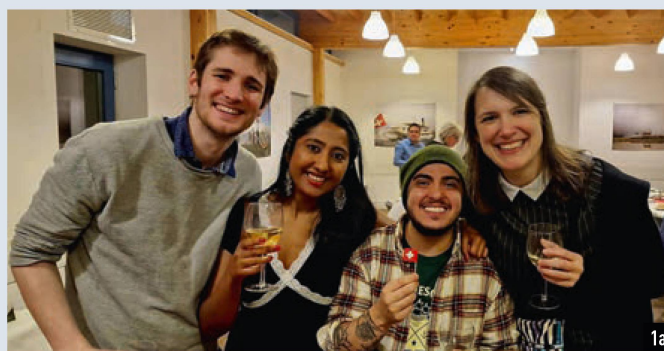
Gathering of members at Lutherhaus in Dublin.

For information about future events, please send an email to swissclubireland@hotmail.com or follow us on Facebook or Instagram.