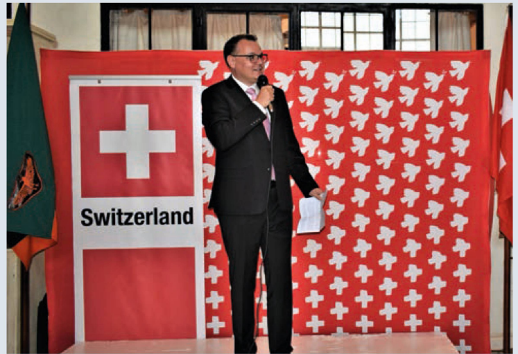
Ambassador of Switzerland to Zimbabwe, Zambia and Malawi Mr. Stéphane Rey during the launch of the new cooperation programme with Zambia.

The programme, celebrated in a recent event in Lusaka, addresses the pressing challenges and contribute significantly to sustainable development in Zambia. Noteworthy features include a comprehensive approach covering food security, healthcare, social protection, climate change, and governance, with a specific focus on the well-being of women and youth. A key aspect is the strategic partnership with the private sector. Government officials in Zambia expressed gratitude to stakeholders and acknowledged the success of the launch, marking a significant chapter in diplomatic relations.