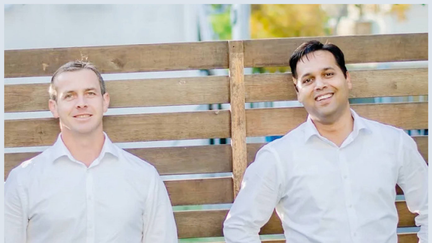
SA's Payment24 accelerates European expansion with acquisition of Swiss firm Inergy 24

Alongside ongoing investment and access to its platform, Payment24 will provide Inergy 24 with access to its development, support, sales,