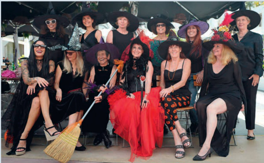
The Swiss Club Board Members wish everyone a Happy New Year!