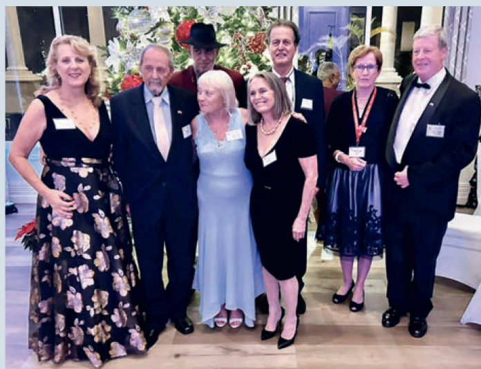
From left to right:

Soon the gourmet buffet was opened and all enjoyed a very tasty dinner. During the dessert round the anticipated raffle draw was getting started. We had some very exciting prizes thanks to the wonderful sponsors supporting our club. One lucky winner took home several items. Some of the top prizes were two economy roundtrip tickets with Swiss from the US to Zürich; a one-week train ticket in 1st Class for two for unlimited travel in Switzerland from Swiss Tourism; and a 3-day-wellness vacation package from the