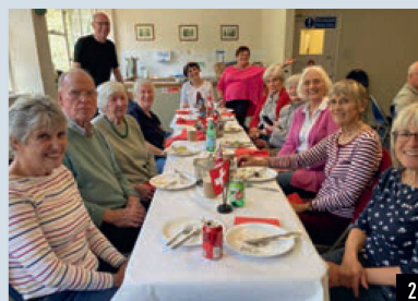
North Wales Swiss meetup.