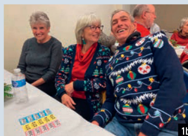
SASC Christmas party.