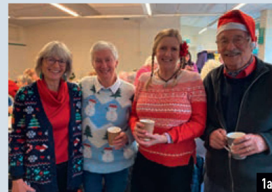
Southern Area Swiss Club (SASC).