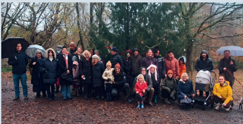
New families with their children joined this year for the traditional walk to meet Samichlaus!