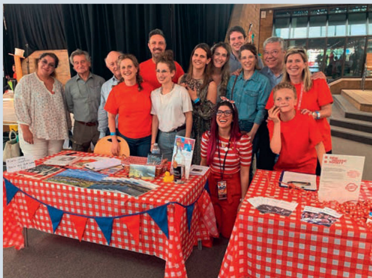
UT members at the SND in London.