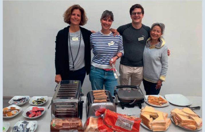
Big Give Christmas Campaign raised an incredible £14,649.70, supporting weekly Breakfast for 70 homeless individuals.