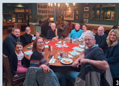
Festive 'Treff' in Liverpool.