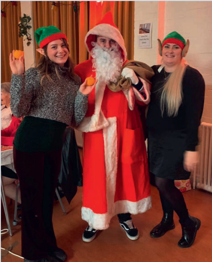
Keeping up the traditions with Raclette and a visit from Samichlaus and the elves.