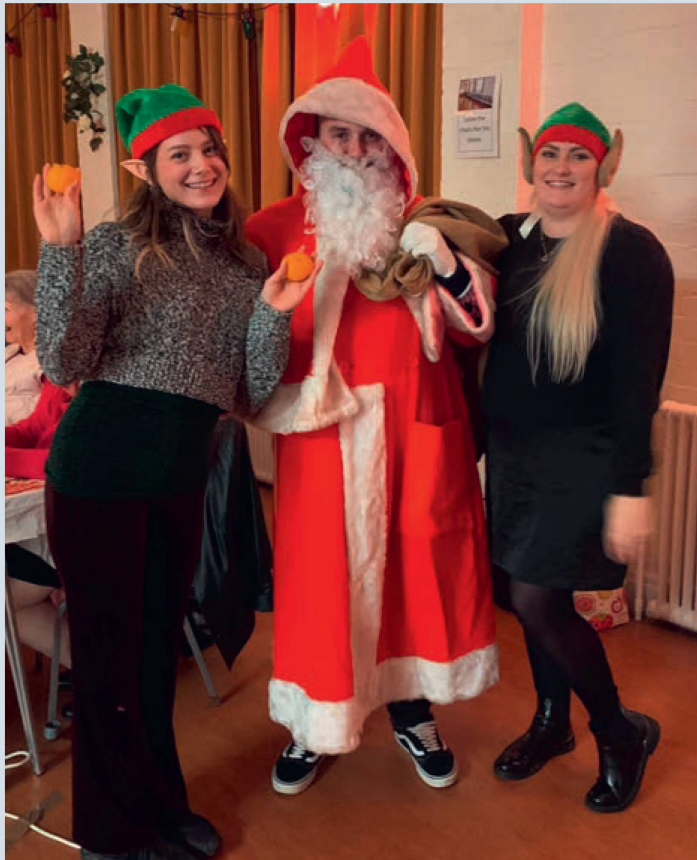
Keeping up the traditions with Raclette and a visit from Samichlaus and the elves.