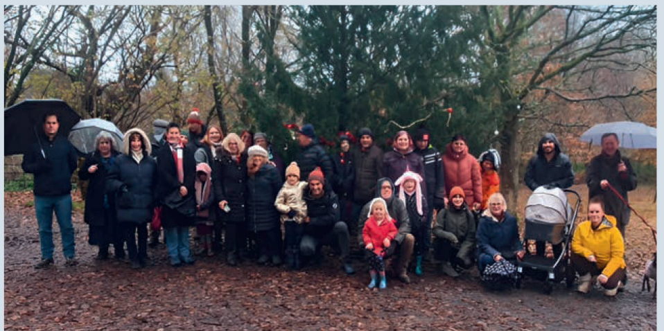
New families with their children joined this year for the traditional walk to meet Samichlaus!