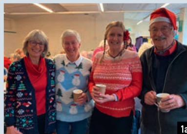
Southern Area Swiss Club (SASC).