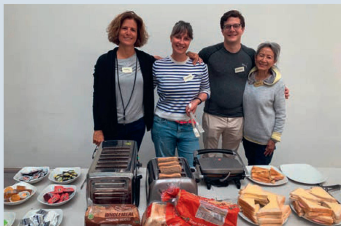
Big Give Christmas Campaign raised an incredible £14,649.70, supporting weekly Breakfast for 70 homeless individuals.