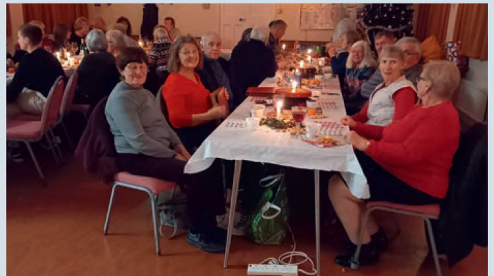
There are about 40 active members in the club.