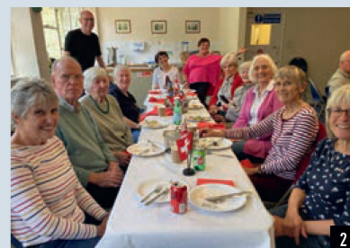
North Wales Swiss meetup.