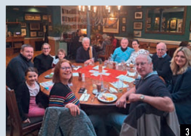
Festive 'Treff' in Liverpool.