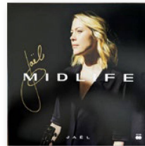
JAËL: “Midlife”. Phonag, 2023.

She can’t escape her musical past. Whenever Jaël releases a new solo album, a not insignificant portion of the public hope for a return to her musical roots – something reminiscent of the trip-hop created by Jaël’s successful band Lunik in its early days.