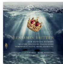
BENJAMIN BRITTEN "Our Hunting Fathers Quatre Chansons françaises", Symphonic Suite from "Gloriana" Prospero Classical 2022

Basel is well known as a city of art. But it is first and foremost a city of music, boasting as many as four different orchestras of international standing. La Cetra specialises in baroque music, and the Basel Sinfonietta in contemporary music. The Basel Chamber Orchestra has a wide-ranging repertoire, while Sinfonieorchester Basel plays opera as well as major symphonies.