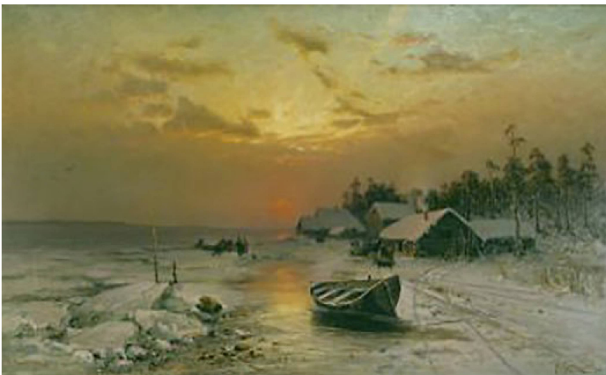
Yuliy Klever (Julius von Klever): Winter sunset. 1885. Oil on canvas