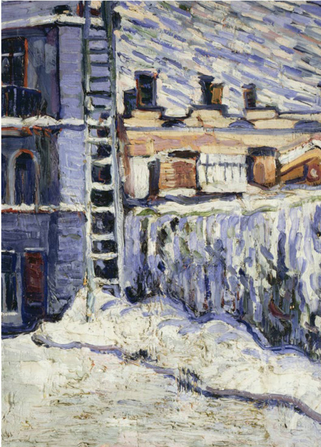
Dawid Burliuk: Winter in the city. Undated. Oil on canvas