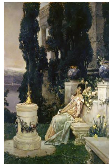
Wilhelm Kotarbinski: At the altar. Undated. Oil on canvas.