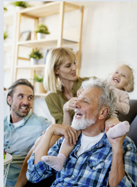
Arranging your estate fairly is a challenge.