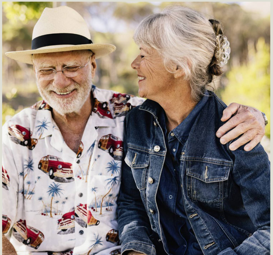
Enjoying retirement abroad: wishful thinking for many Swiss.

Other subjects included general information about finances, retirement homes, pol-