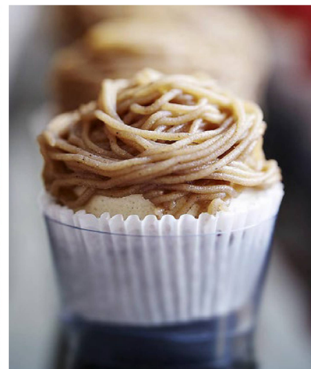
Right: Chestnuts are a Swiss winter staple even in urban areas. Roast chestnuts are sold in many city centres. Vermicelles also remains a popular dessert, in defiance of all the latest trends.

groves becoming wild. There was resistance from the general public. Clearing space to prevent chestnut trees merging into the woods was seen as harmful to the environment. “Chestnut trees with their many light areas provide a biotope for completely different flora and fauna than other trees do,” explains Schoeck. “This is important for biodiversity. Chestnut groves are also diversity hotspots; the composition of the diversity is just different.”