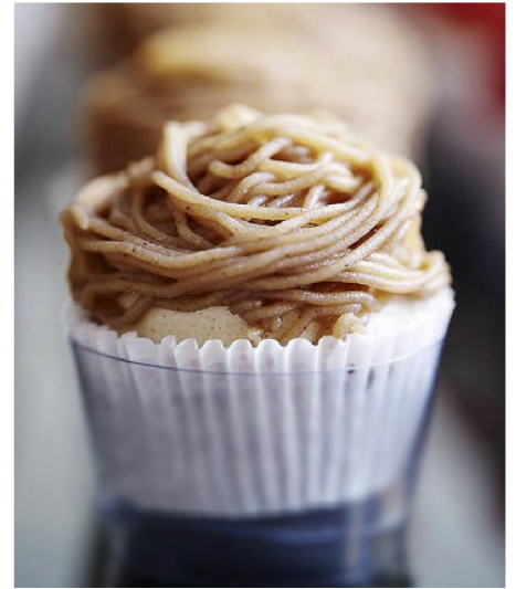
Right: Chestnuts are a Swiss winter staple even in urban areas. Roast chestnuts are sold in many city centres. Vermicelles also remains a popular dessert, in defiance of all the latest trends.

groves becoming wild. There was resistance from the general public. Clearing space to prevent chestnut trees merging into the woods was seen as harmful to the environment. “Chestnut trees with their many light areas provide a biotope for completely different flora and fauna than other trees do,” explains Schoeck. “This is important for biodiversity. Chestnut groves are also diversity hotspots; the composition of the diversity is just different.”