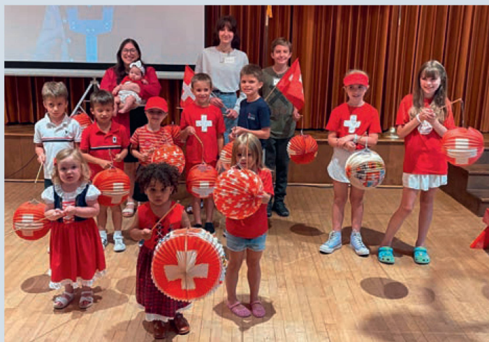
The children had a blast parading around the premises with lanterns in true Swiss style!