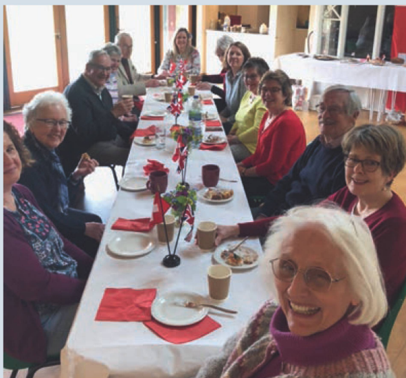
The club's members prepared wonderful cakes and delicacies to enjoy their gathering.