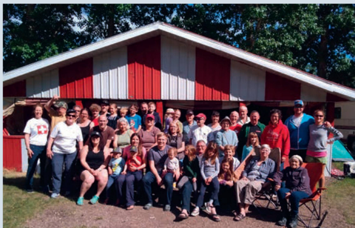
Above: Group pictures from the Landsgemeinde in June 2022