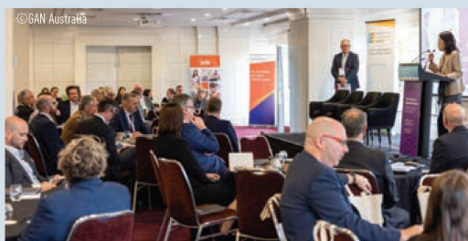
Plenary session at the 'Future of apprenticeship' conference in Melbourne.