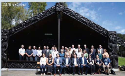
Powhiri (Indigenous Maori welcome ceremony) for the 'Future of apprenticeships' delegates on Waiheke Island near Auckland.

major companies across the Swiss economy, Federal Departments and even the Swiss Confederation – as was the case in 2021 with then President of the Swiss Confederation Guy Parmelin, who started his professional career after his apprenticeship in agriculture. In Switzerland, VET is part of a flexible and permeable education system that ensures everyone has access to further training, higher education, or the possibility to explore career changes throughout their lives. There are no dead ends in the Swiss education system. The Swiss model of apprenticeship is widely considered a success story, and yet, in a fast-changing environment, exchanges amongst experts, trainers and practitioners is necessary to keep up with today's challenges. This led a