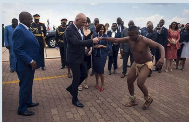
Berset (centre) was invited for a traditional dance during the official welcome ceremony in Botswana. Host Mokgweetsi Masisi (left) looks on.