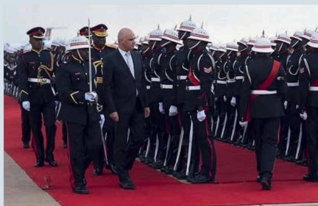
Berset was received with full military honours in Botswana.

It's the first official visit to Botswana by a Swiss president.