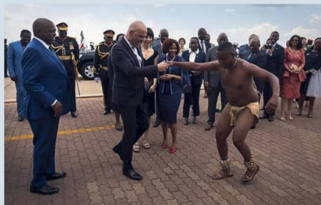
Berset (centre) was invited for a traditional dance during the official welcome ceremony in Botswana. Host Mokgweetsi Masisi (left) looks on.