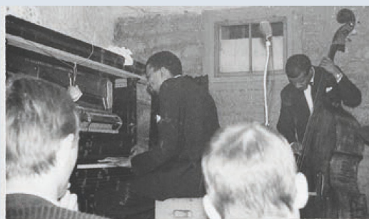
The Dollar Brand Trio at a Cellar Concert in St. Gallen in 1962

ARTICLE: UNIVERSITÄT BASEL, ZENTRUM FÜR AFRIKASTUDIEN