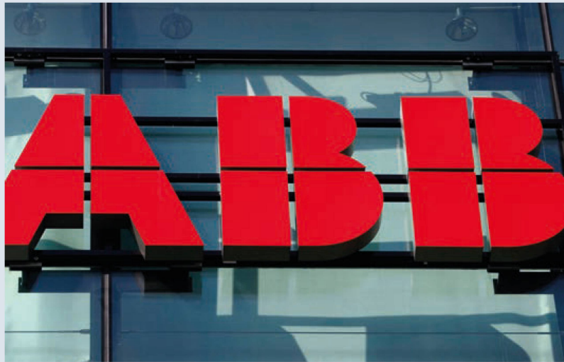
South Africa's National Prosecuting Authority said ABB had agreed to pay punitive reparations to the country.