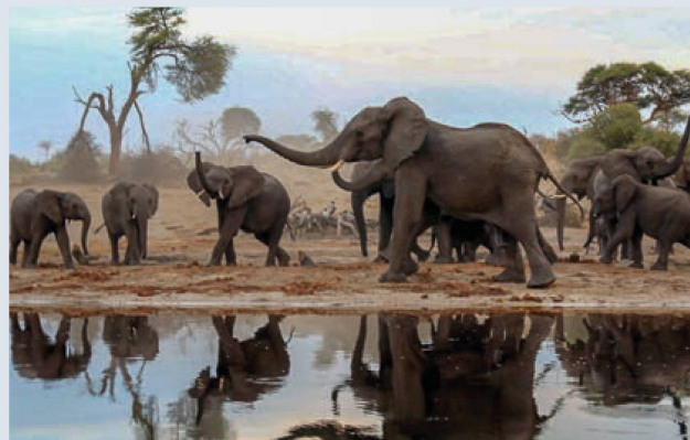
Artificial Intelligence is used to identify sounds of elephants.

The data is sent automatically via the mobile phone network to a computer server where it is crunched and analysed. The "Smart Mic" can precisely identify a wolf call with an accuracy of 500 metres. The device should save game wardens time and cover larger areas than traditional camera traps. It is also much cheaper; a prototype costs CHF450. The invention has also been successfully