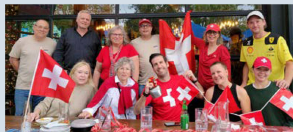
Swiss cheering the Switzerland Soccer team playing against Serbia