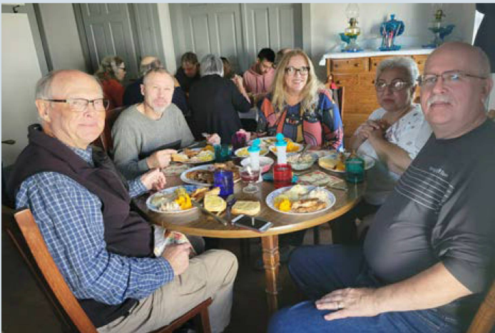
Our tour at the Amish Colony in Harmony, MN, started with an authentic Amish luncheon.