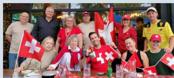
Swiss cheering the Switzerland Soccer team playing against Serbia