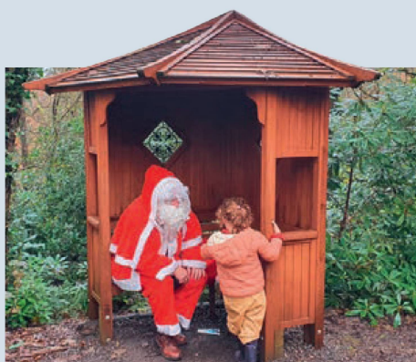
Families, children and club's members who enjoyed the event.