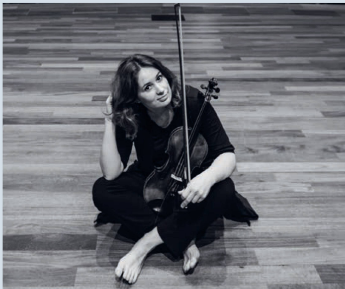
More info about Kopatchinskaja's performances: barbican.org.uk

The Barbican in London will present an Artist Spotlight series with Moldovan-Austrian-Swiss violinist Patricia Kopatchinskaja from February to April 2023, including a masterclass and two concerts.