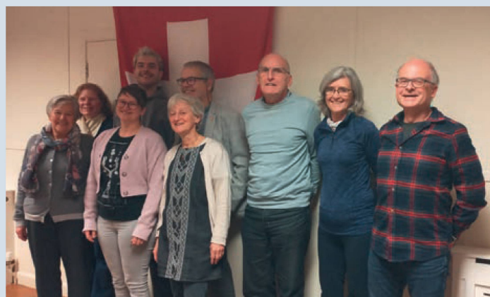
The new committee of the Swissclub Edinburgh.

Delicious 'Grittibänze', 'Lebkuchen' and more at the buffet of the Christmas party.