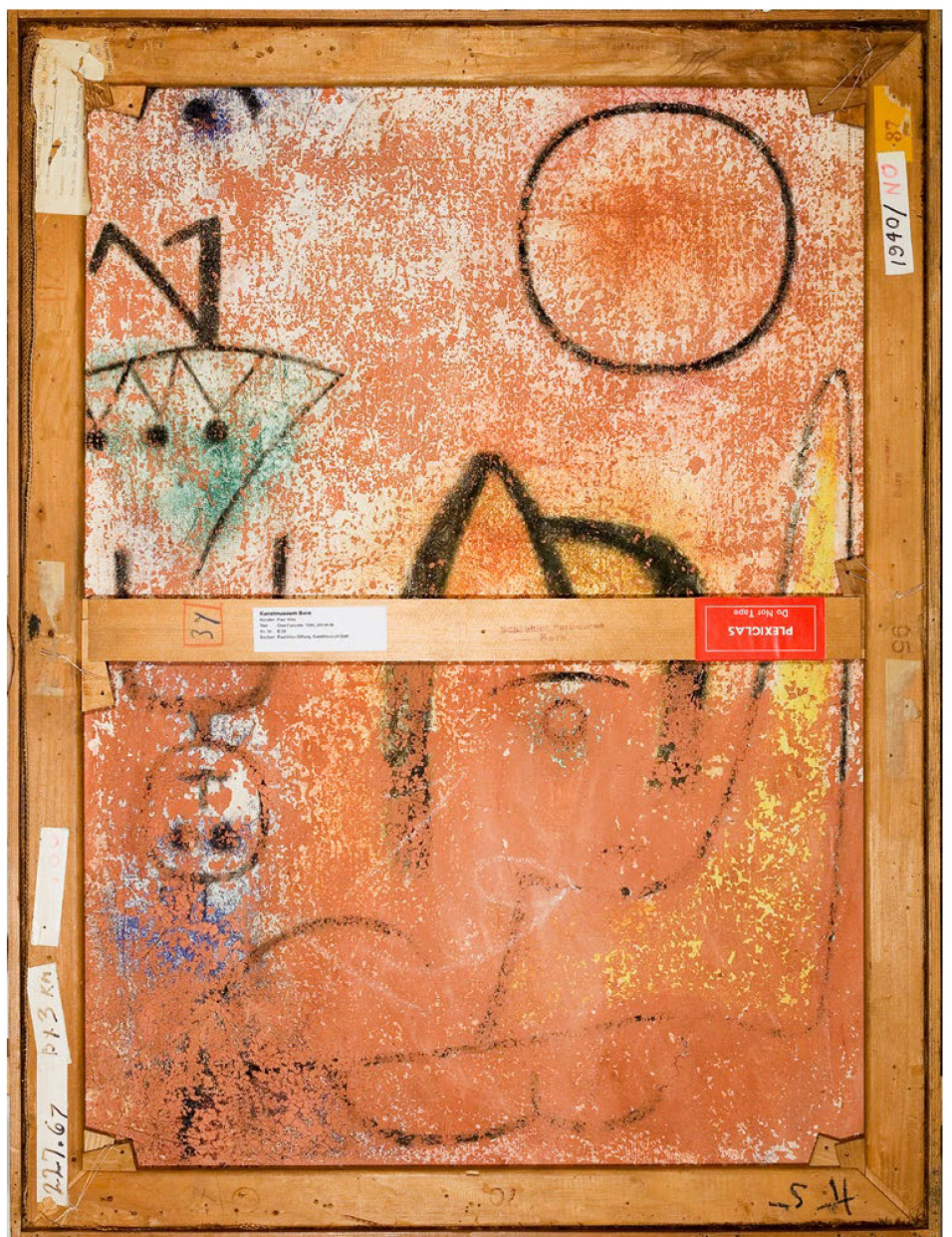
Reverse side of "Glass Facade": "Girl dies and becomes", 1940, 288 71.3 x 95.7 cm Zentrum Paul Klee, Bern